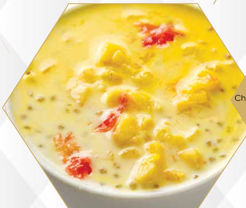
1446 楊枝甘露 Chilled Mango & Pomelo Sago £6.20