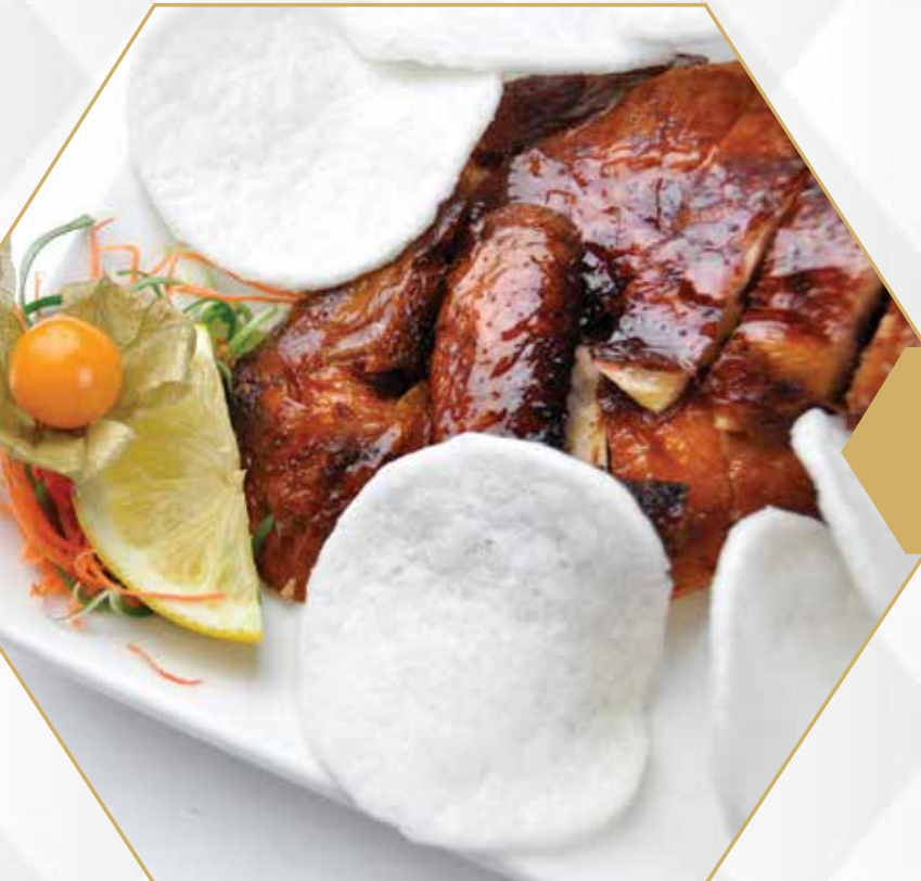
1323 1324 金牌炸子雞 "Royal China" Crispy Chicken