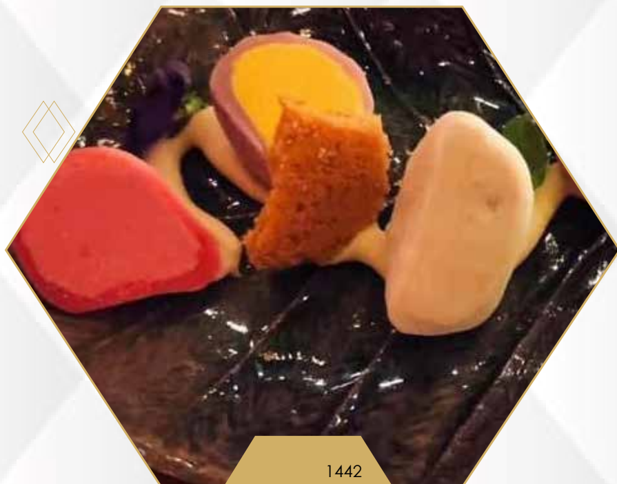
1442 雪糕糯米糍 Mixed Mochi Ice Cream £8.50