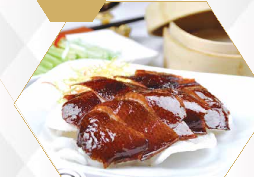
北京填鴨 Peking Duck