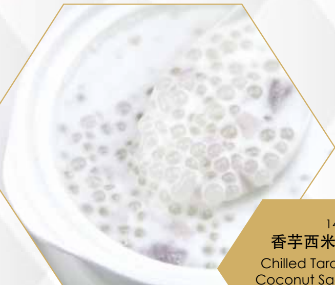
1439 香芋西米露 Chilled Taro & Coconut Sago £5.80