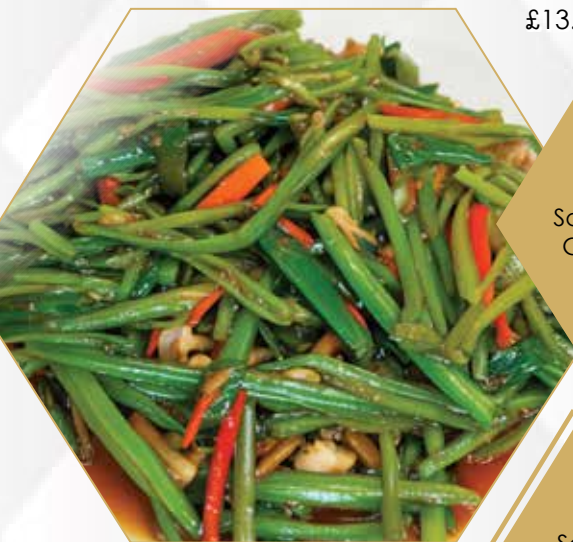
1370 蒜茸炒通菜 Sautéed Morning Glory with Garlic £17.80