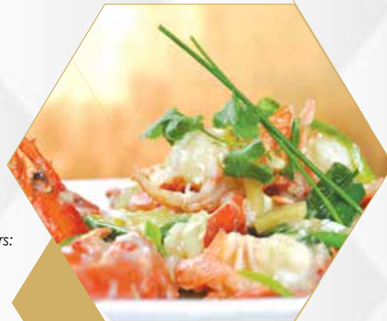
生猛龍蝦 Fresh Lobster