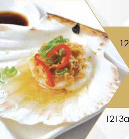
1212 蒸帶子 清蒸 豉汁

Steamed Fresh Scallop Served in a choice of flavours: