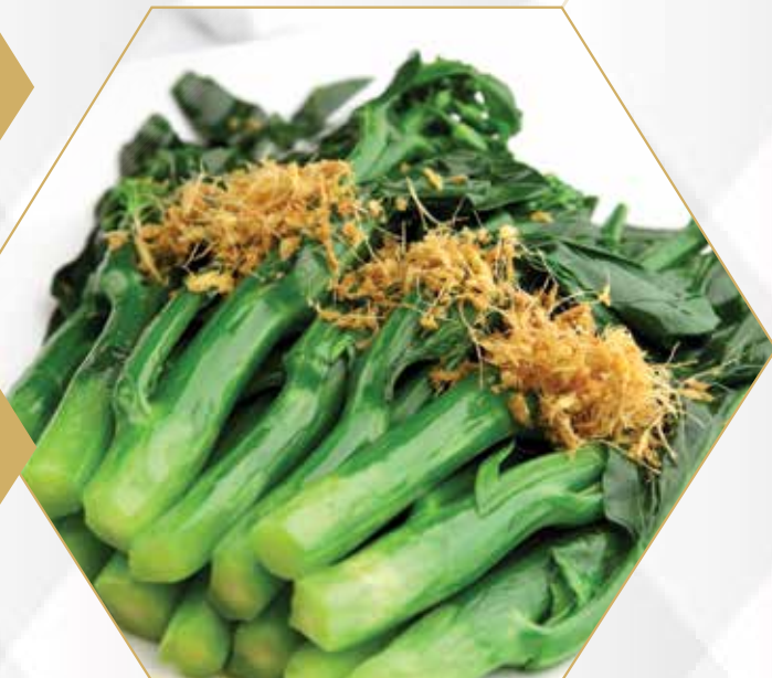
1372 薑汁炒芥蘭 Sautéed Chinese Broccoli with Ginger £17.80