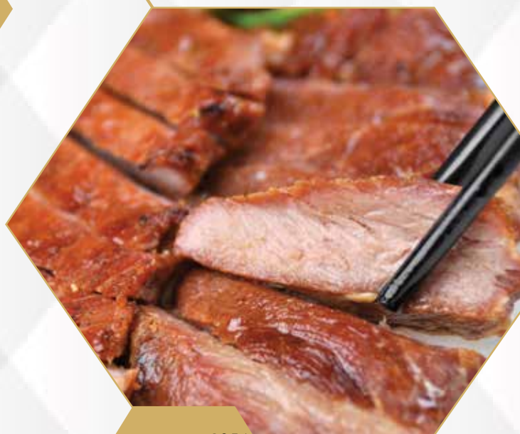
1354 蜜汁叉燒 Honey Roasted Pork £17.80