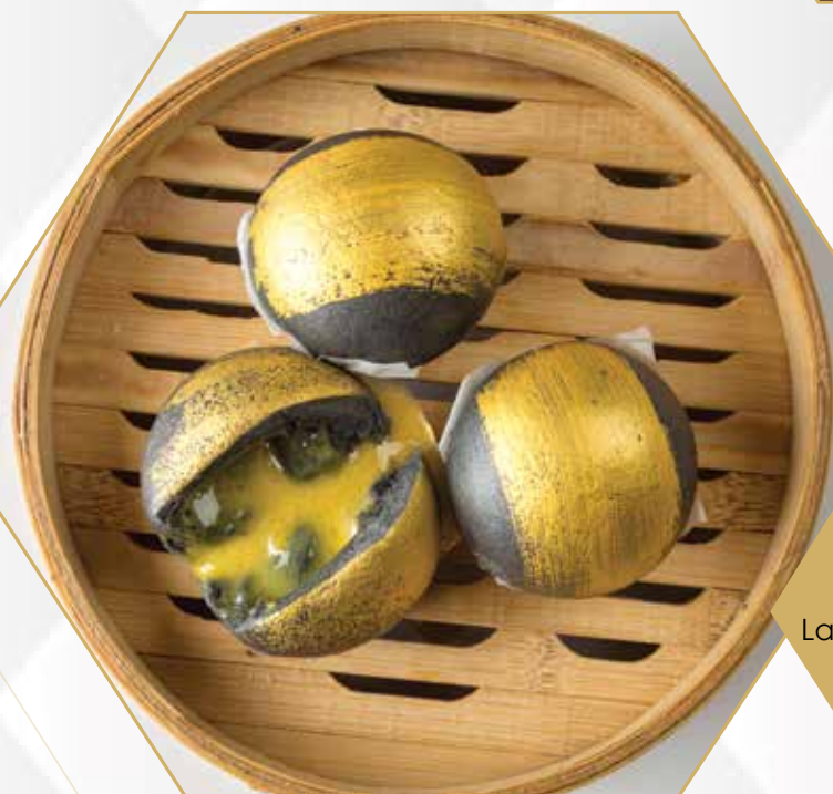
1444 黑金流沙包 Black Gold Yolk Lava Custard Buns £7.80