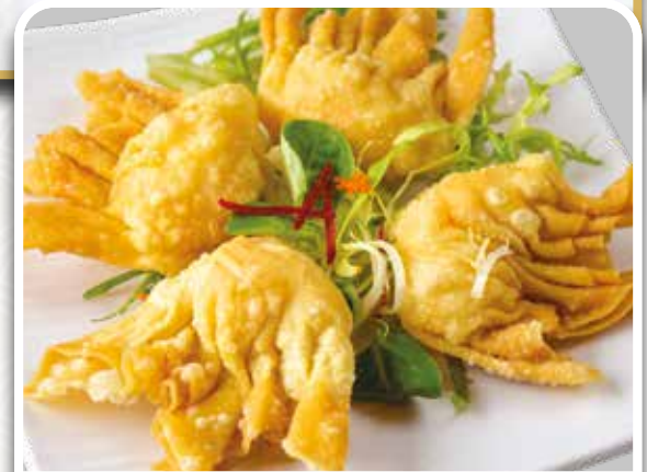
沙律明蝦角 Deep Fried Prawn Dumplings £6.80