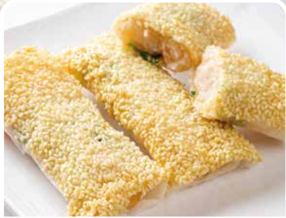
芝麻炸蝦卷 Sesame Prawn Rolls £7.30