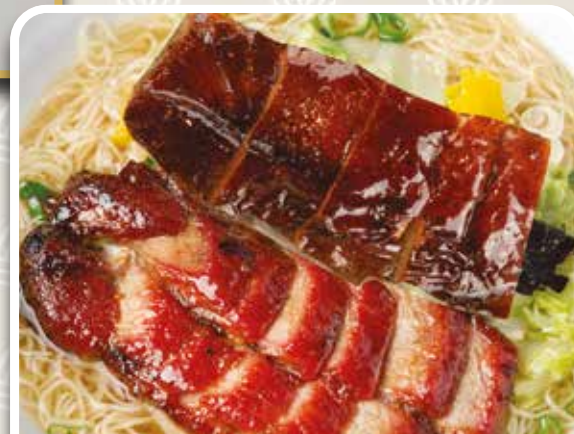
燒鴨又燒湯麵 Roast Duck & Roast Pork Soup Noodles £16.80