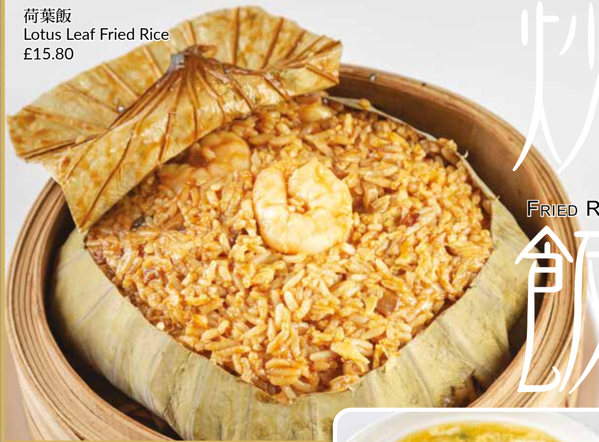
荷葉飯 Lotus Leaf Fried Rice £15.80