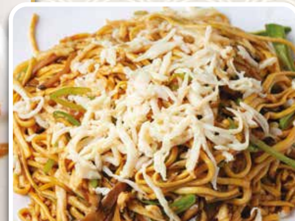
雞絲伊麵 Shredded Chicken E-Fu Noodles £13.80