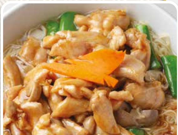
雞球湯麵 Chicken Balls Soup Noodles £13.80