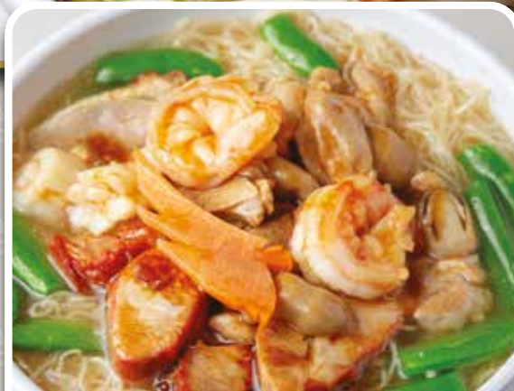
揚州湯麵 Assorted Meats Soup Noodles £14.80