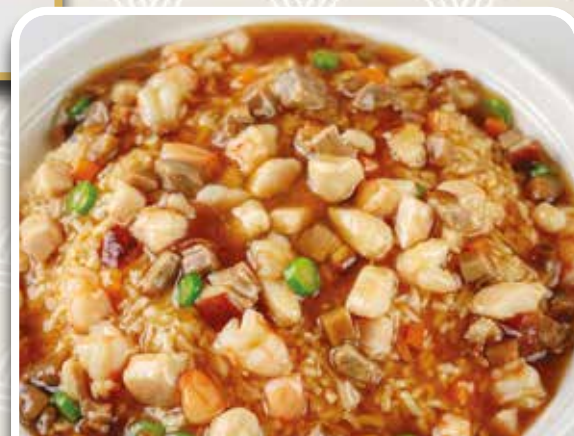
福建炒飯 Fukien Fried Rice £15.80