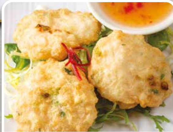
煎炸墨魚餅 Fried Minced Cuttlefish Balls £6.80