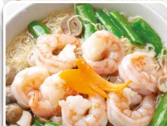
蝦球湯麵 Fresh Prawn Balls Soup Noodles £15.80