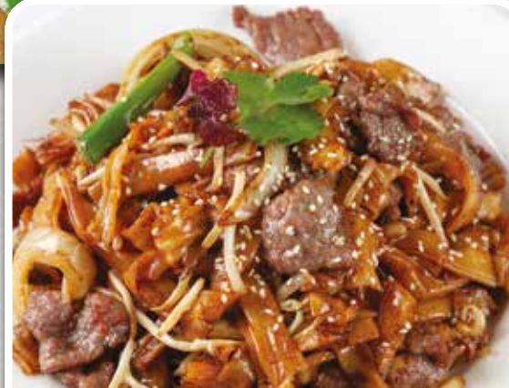
乾炒牛河 Sliced Beef Ho Fun with Soya Sauce £14.80