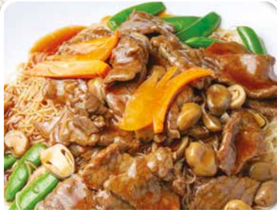
牛肉辦麵 Sliced Beef Braised Noodles £13.80