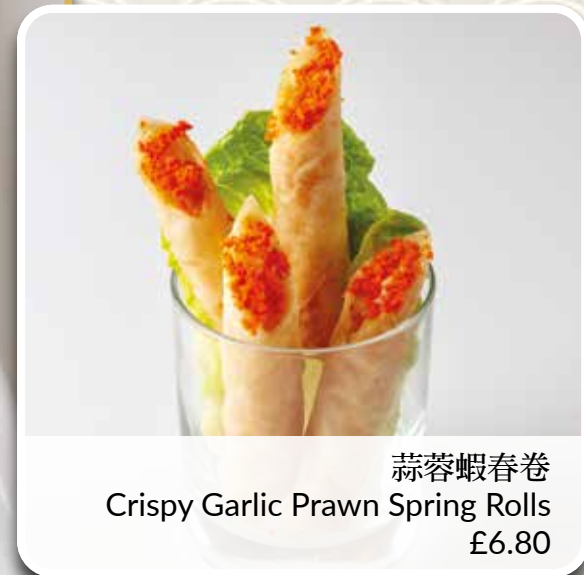
蒜蓉蝦春卷 Crispy Garlic Prawn Spring Rolls £6.80

香脆齋卷 Fried Vegetarian Spring Rolls (V) £6.80