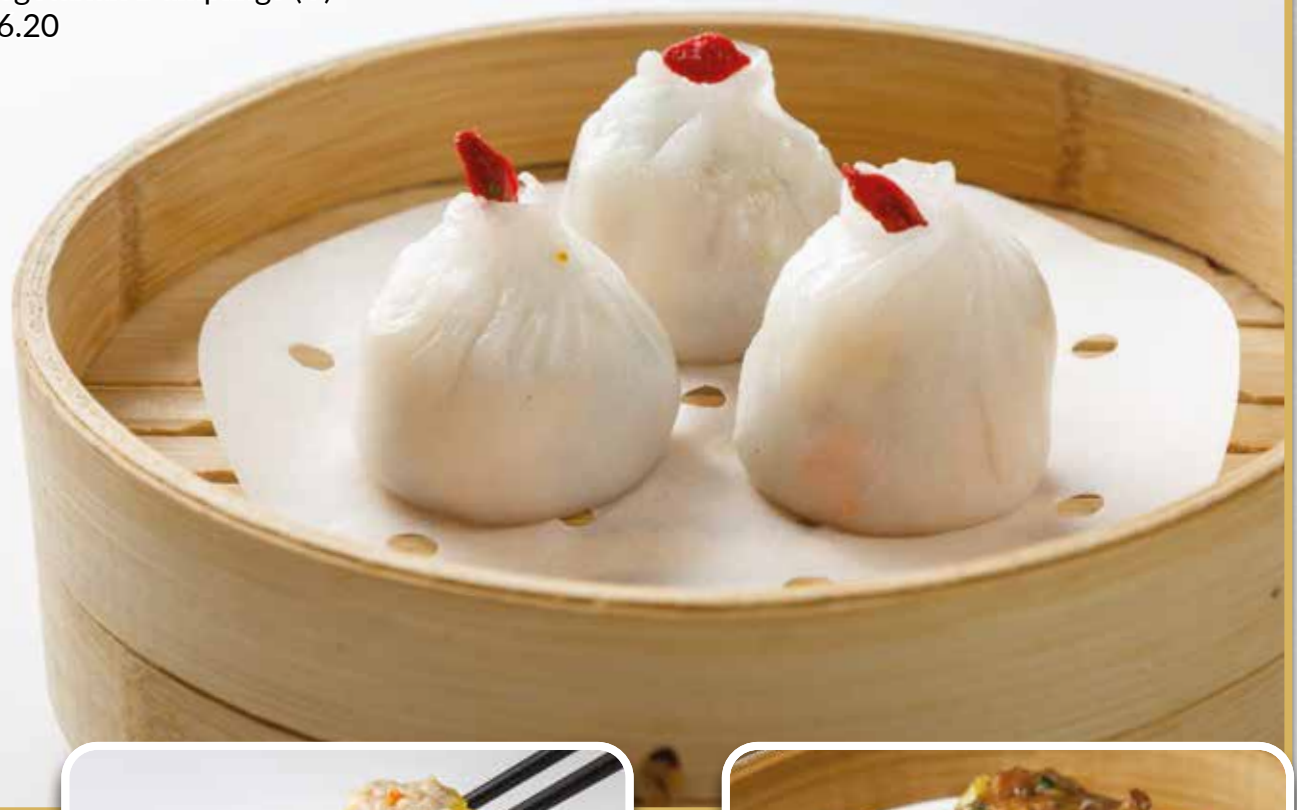
水晶羅漢餃 Vegetarian Dumplings (V) £6.20