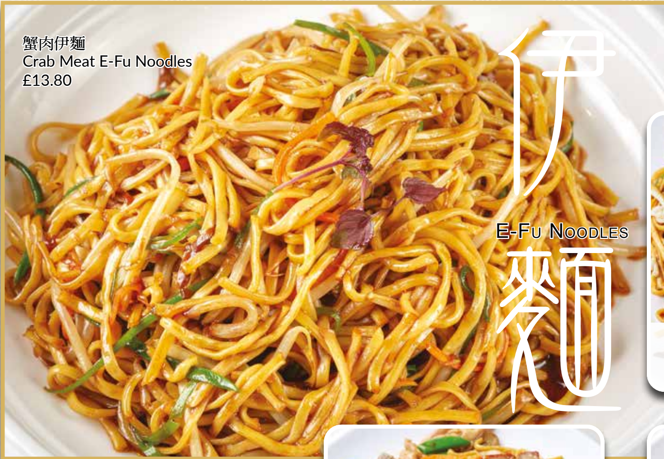
蟹肉伊麵 Crab Meat E-Fu Noodles £13.80