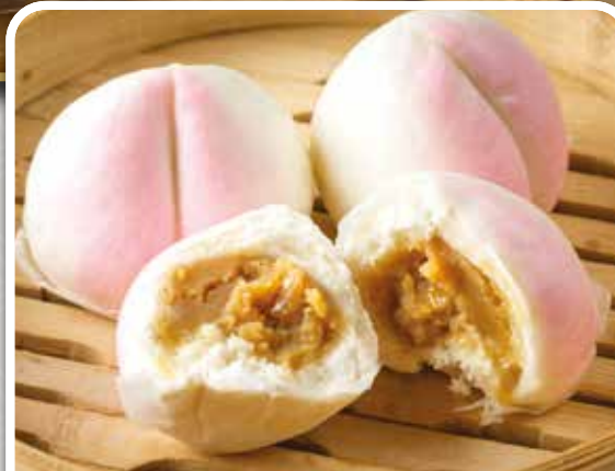
蛋黃蓮蓉壽包 Sweet Lotus Seed Buns £5.80