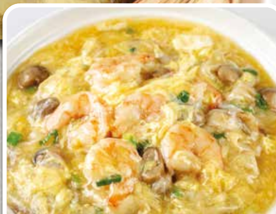
滑蛋蝦飯 Fresh Prawns & Scrambled Egg Rice £15.80