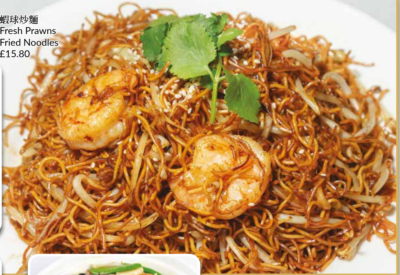
蝦球炒麵 Fresh Prawns Fried Noodles £15.80