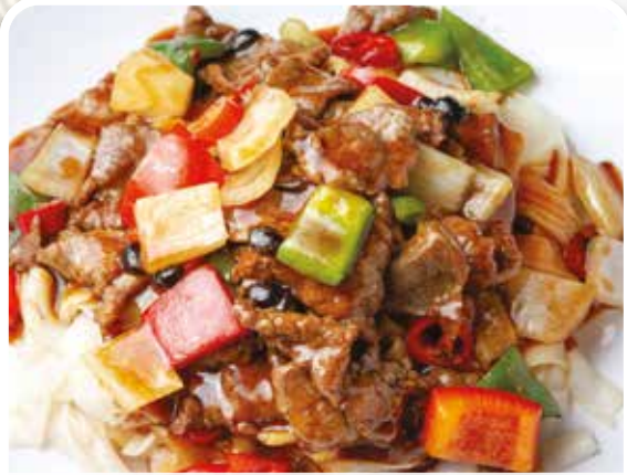
豉椒牛河 Sliced Beef Ho Fun with Black Bean Sauce £14.80