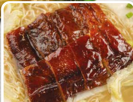
燒鴨湯麵 Roast Duck Soup Noodles £14.80