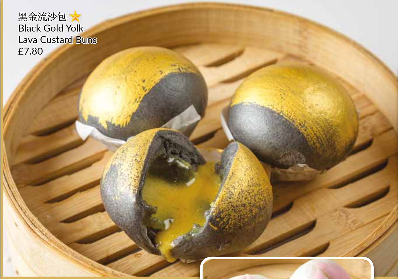
黑金流沙包 ★ Black Gold Yolk Lava Custard Buns £7.80