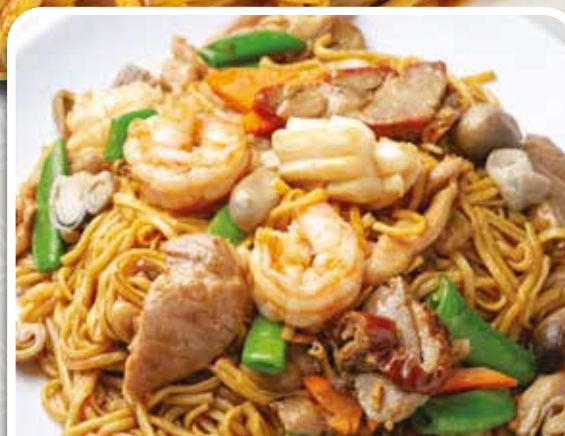
燴府伊麵 Mixed Meat E-Fu Noodles £15.80