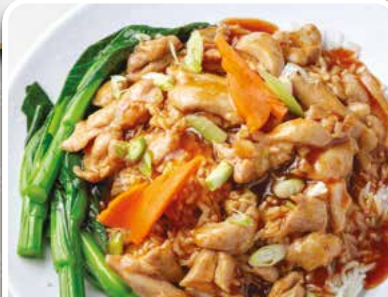
菜遠雞球飯 Chicken & Vegetables with Rice £13.80