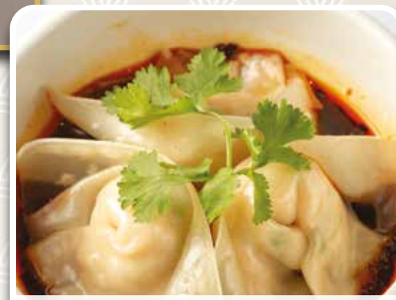
紅油豬肉餃子 Steamed Chilli Pork Dumplings (S) £8.80