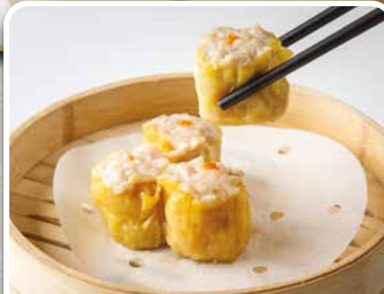
乾蒸燒賣 Minced Pork & Shrimp Dumplings £6.50