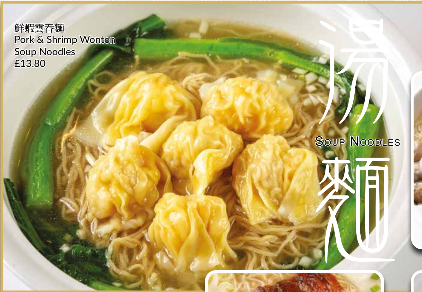
鮮蝦雲吞麵 Pork & Shrimp Wonton Soup Noodles £13.80