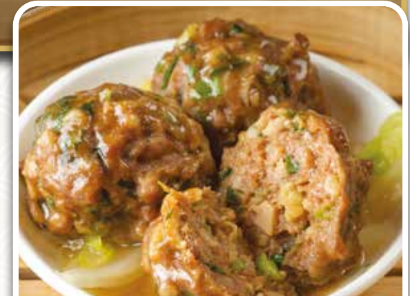
西菜牛肉 Beef Meat Balls £6.50