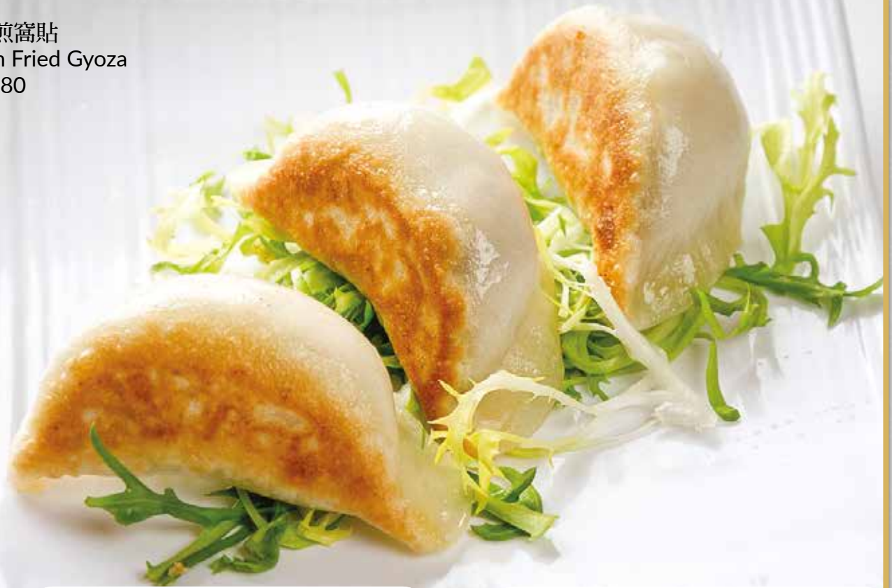
生煎窩貼 Pan Fried Gyoza £6.80