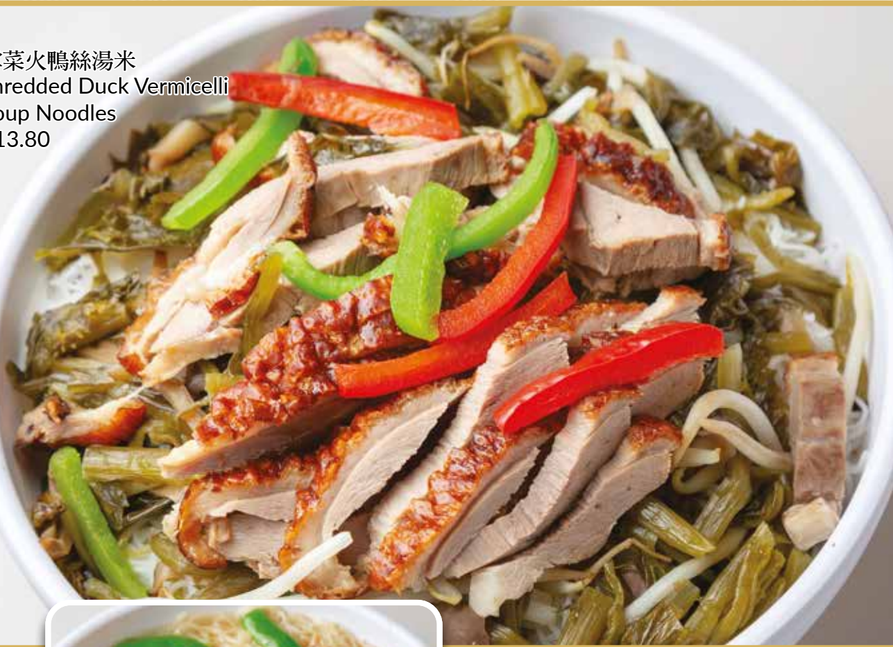
雪菜火鴨絲湯米 Shredded Duck Vermicelli Soup Noodles £13.80