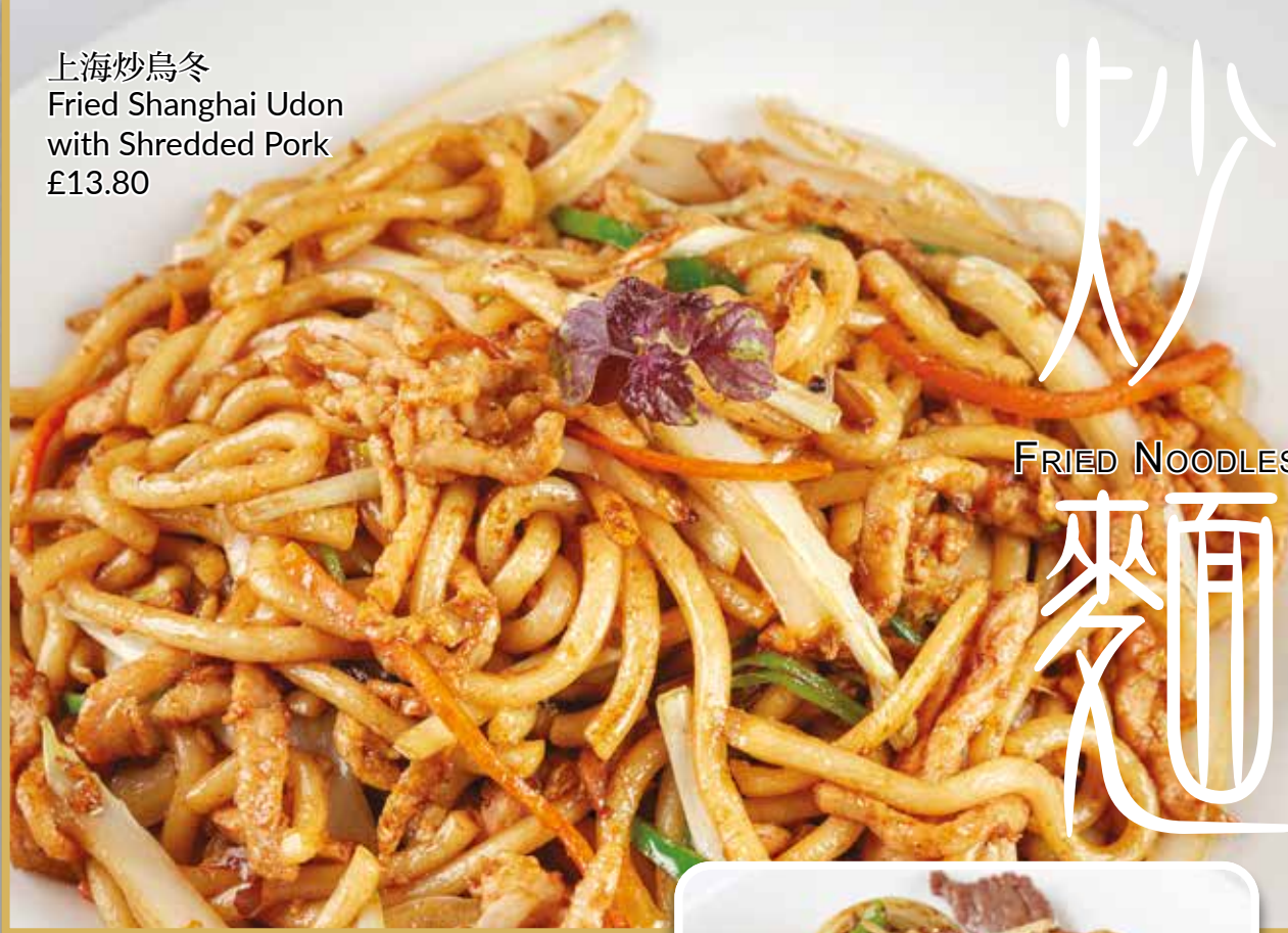
上海炒烏冬 Fried Shanghai Udon with Shredded Pork £13.80