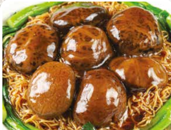
北菇辦麵 Black Mushroom Braised Noodles £12.80