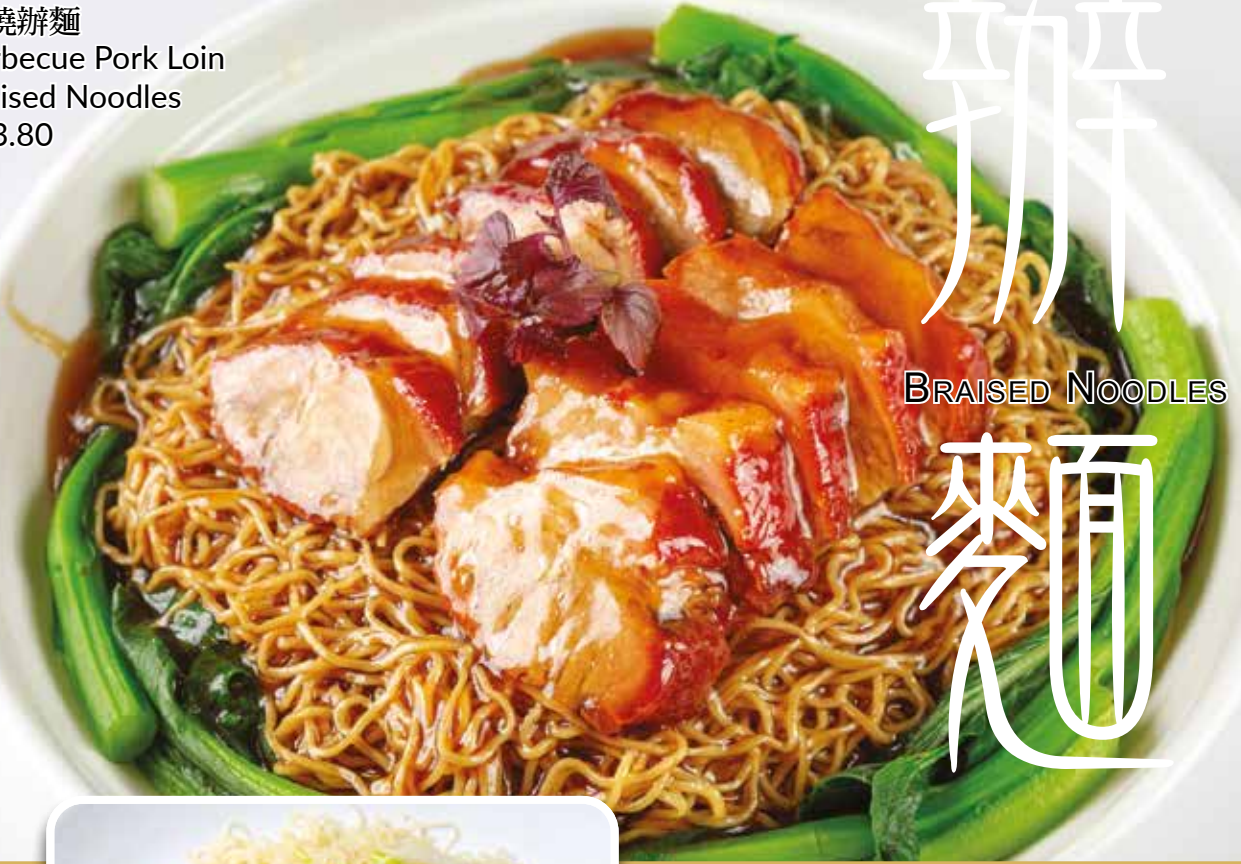
叉燒辦麵 Barbecue Pork Loin Braised Noodles £13.80