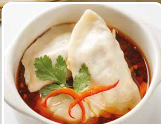
紅油雞餃子 Steamed Chilli Chicken Dumplings (S) £7.80