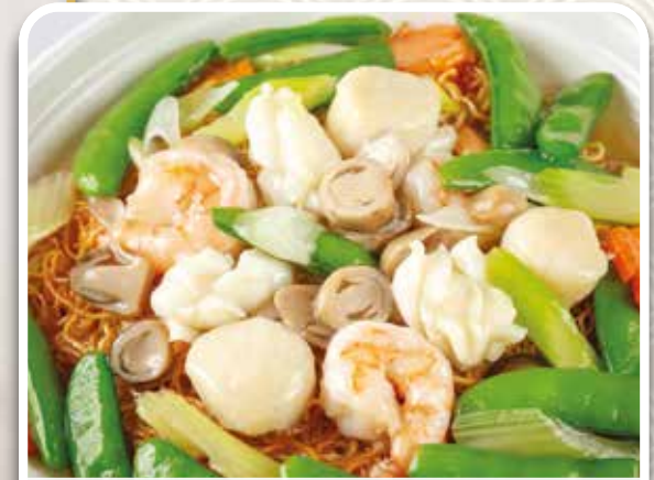
三鮮炒麵 Mixed Seafood Fried Noodles £15.80