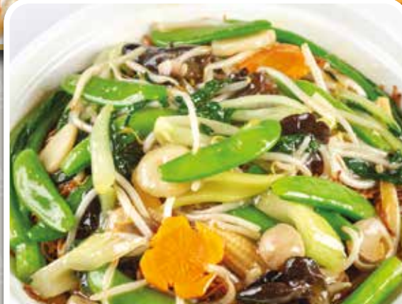
雜菜炒麵 Fried Noodles with Mixed Vegetables £12.80