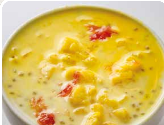
楊枝甘露 Chilled Mango & Pomelo Sago £6.50