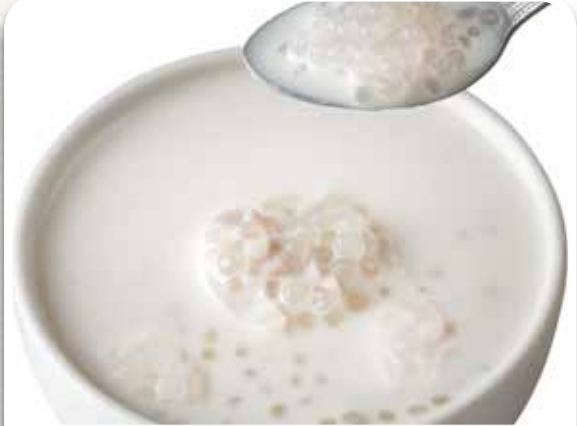
芋頭西米露 Chilled Taro & Coconut Sago £8.80