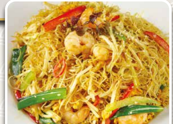
星洲炒米 Singapore Rice Vermicelli £13.80