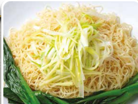
薑蔥辦麵 Ginger & Spring Onions Braised Noodles £10.00