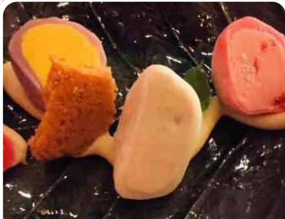
雪糕糯米糍 Mixed Mochi Ice Cream £8.50