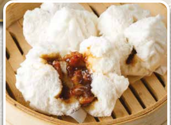
蠔油叉燒包 Roast Pork Buns £6.80