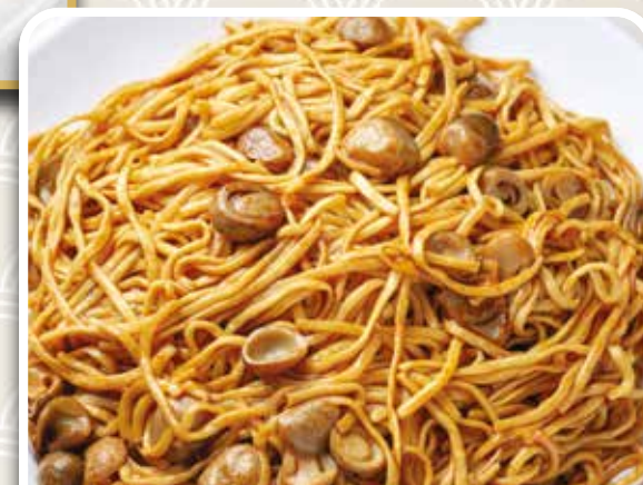
乾燒伊麵 Straw Mushrooms E-Fu Noodles £13.80