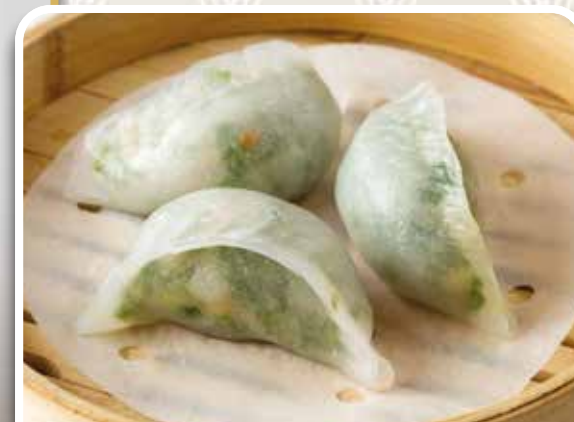
鮮蝦韭菜餃 Prawn & Chive Dumplings £7.50