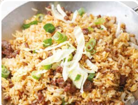
生炒牛肉飯 Fried Rice with Minced Beef £13.80