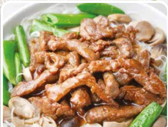
牛柳絲湯米 Shredded Beef Steak Soup Noodles £13.80