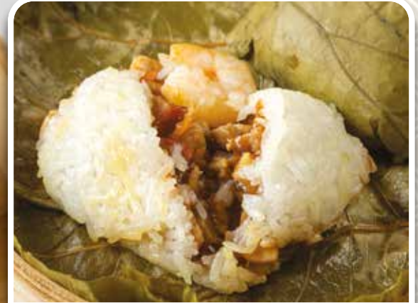
金牌糯米雞 Glutinous Rice in Lotus Leaves £7.50