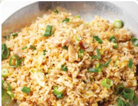
咸魚雞粒炒飯 Fried Rice with Salted Fish & Chicken £14.80