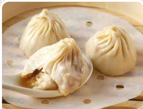
上海小籠包 Shanghai Pork Dumplings £6.80