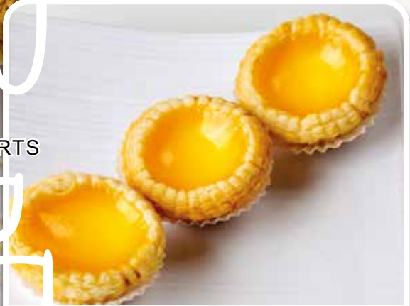
酥皮雞蛋撻 Freshly Baked Egg Tarts £6.20