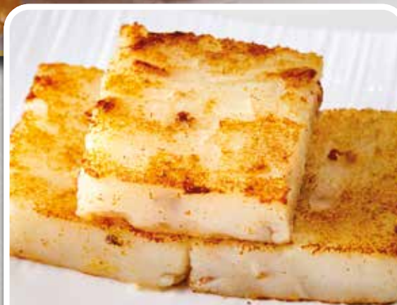
臘味蘿蔔糕 Turnip Cake with Cured Meats £6.80

海鮮腐皮卷 Crispy Bean Curd Prawn Rolls £6.80