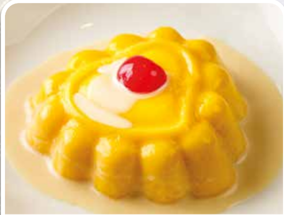
芒果布甸 Chilled Mango Pudding £5.80