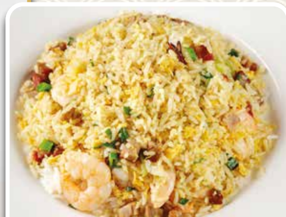
揚州炒飯 Yeung Chow Fried Rice £15.80