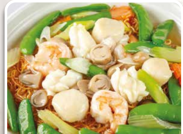
三鮮炒麵 Mixed Seafood Fried Noodles £15.80