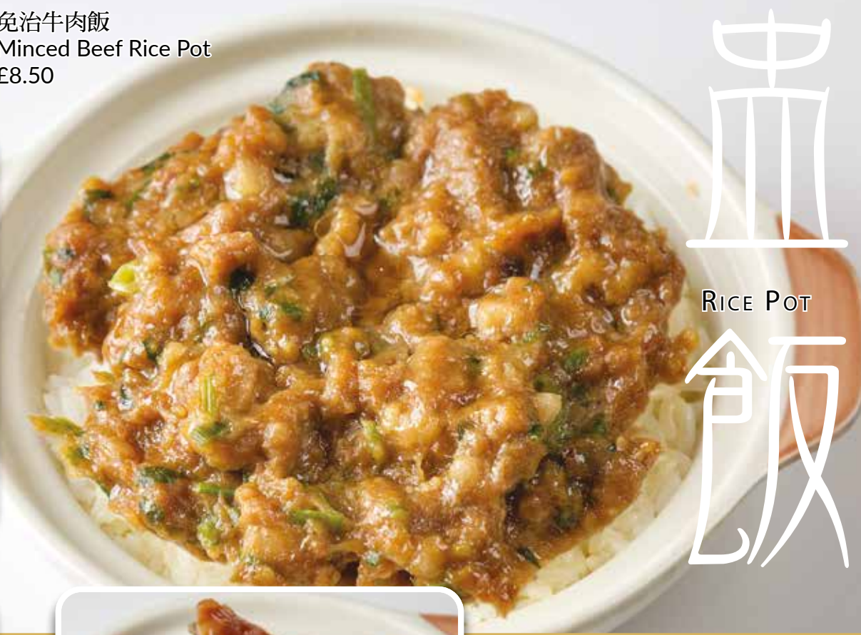
免治牛肉飯 Minced Beef Rice Pot £8.50