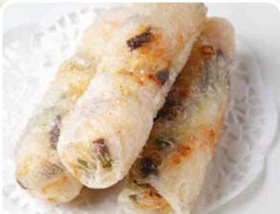
越南春卷 Vietnamese Spring Rolls £6.50