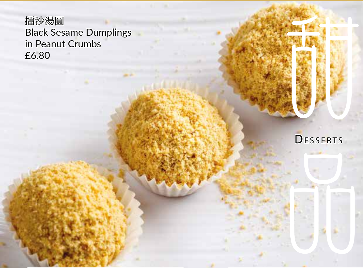
播沙湯圓 Black Sesame Dumplings in Peanut Crumbs £6.80