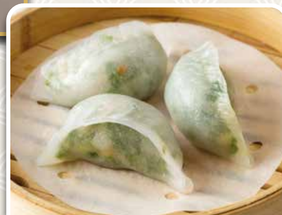
鮮蝦韭菜餃 Prawn & Chive Dumplings £6.80