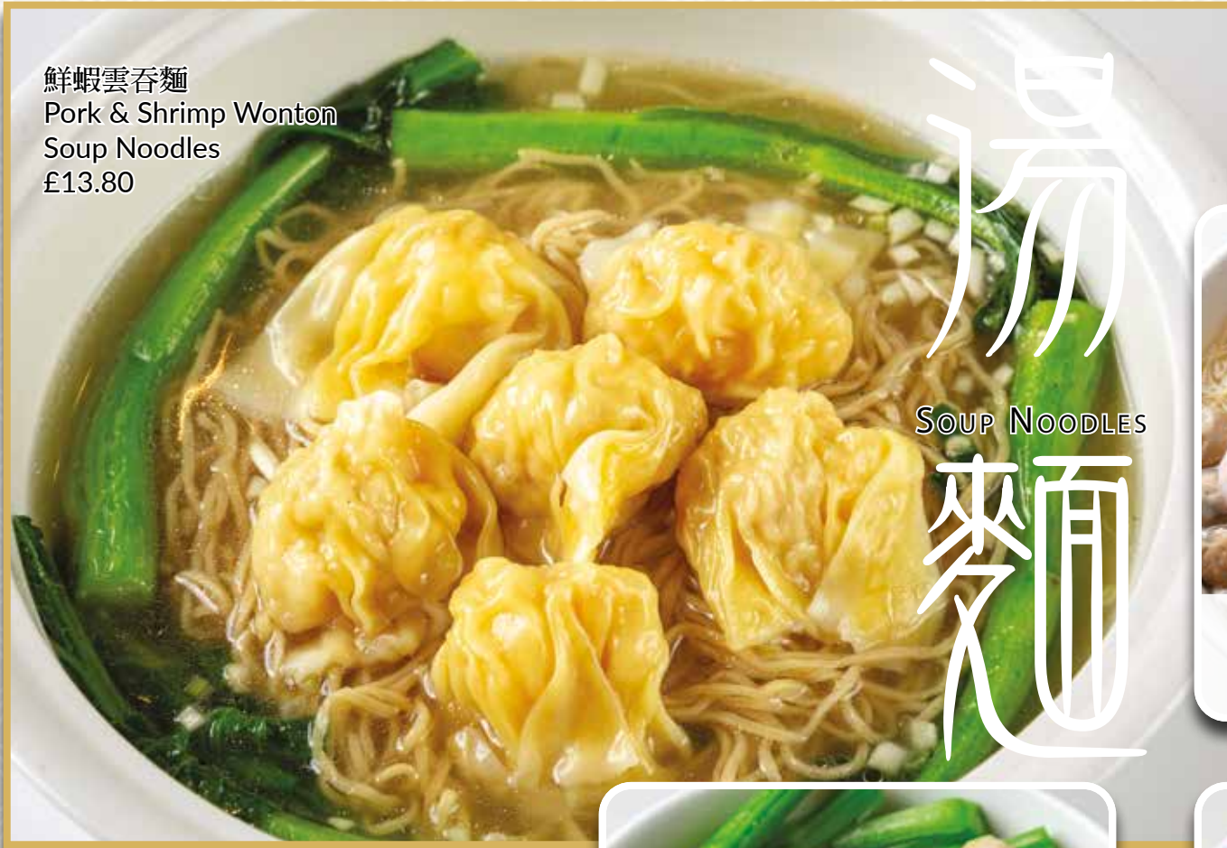
鮮蝦雲吞麵 Pork & Shrimp Wonton Soup Noodles £13.80