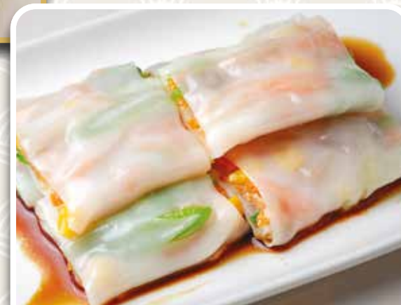
羅漢齋腸粉 Vegetarian Cheung Fun (V) £6.80