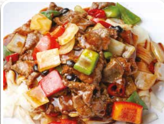
豉椒牛河 Sliced Beef Ho Fun with Black Bean Sauce £13.80