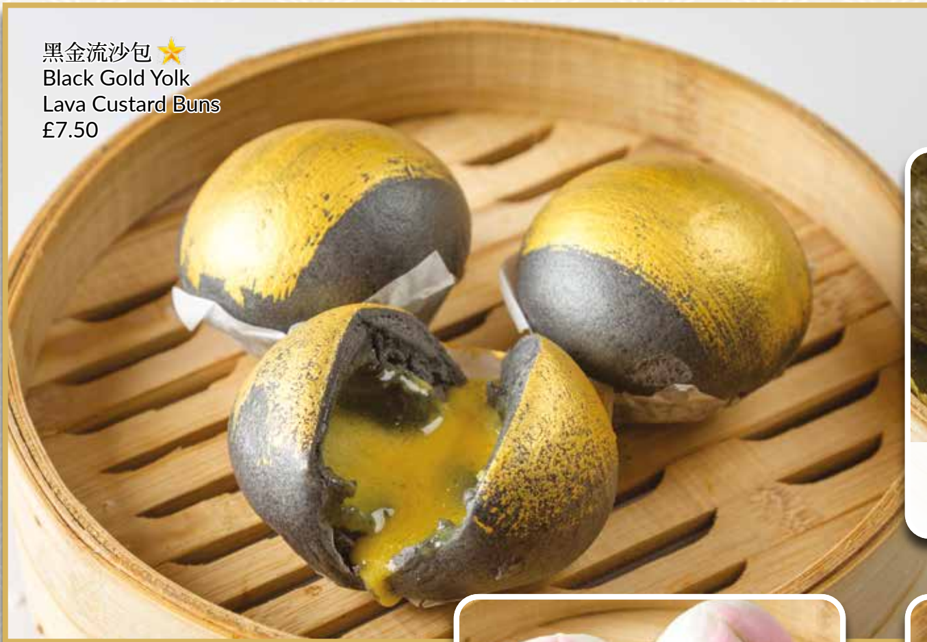
黑金流沙包 ★ Black Gold Yolk Lava Custard Buns £7.50