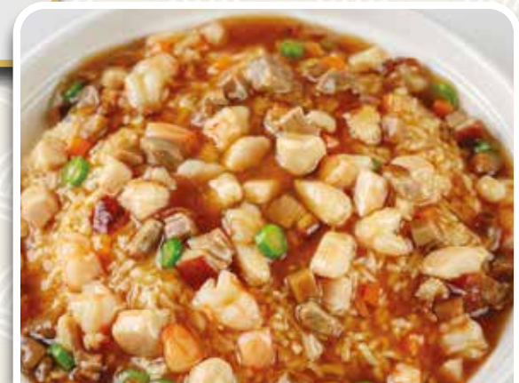
福建炒飯 Fukien Fried Rice £15.80