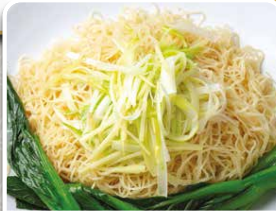
薑蔥辦麵 Ginger & Spring Onions Braised Noodles £10.00