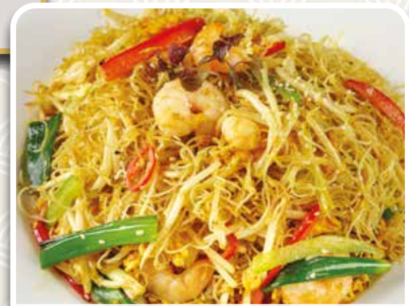
星洲炒米 Singapore Rice Vermicelli £13.80