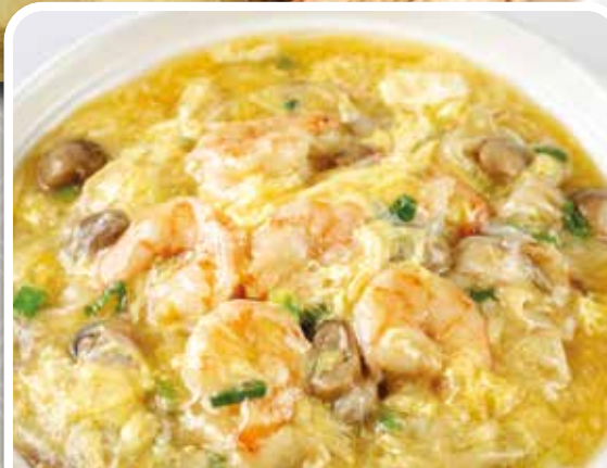
滑蛋蝦飯 Fresh Prawns & Scrambled Egg Rice £15.80