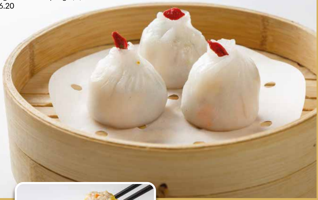
水晶羅漢餃 Vegetarian Dumplings (V) £6.20