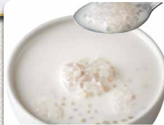
芋頭西米露 Chilled Taro & Coconut Sago £5.80