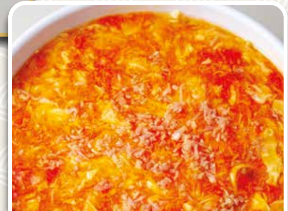
鴻圖窩麵 Crab Meat & Roe Soup Noodles £15.80