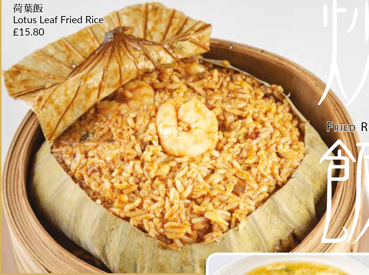
荷葉飯 Lotus Leaf Fried Rice £15.80