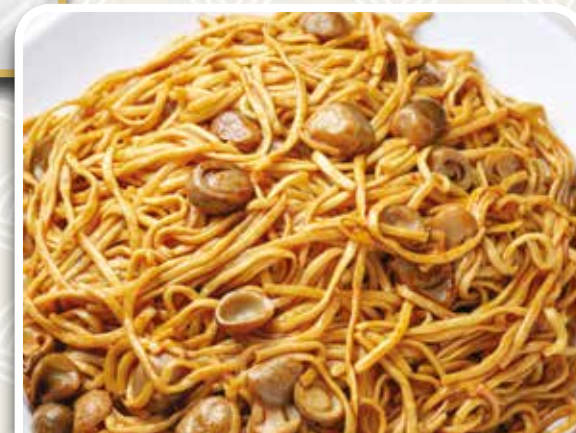
乾燒伊麵 Straw Mushrooms E-Fu Noodles £13.80