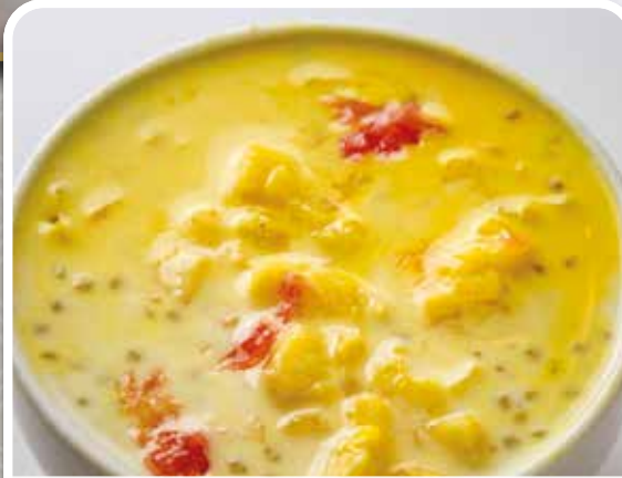
楊枝甘露 Chilled Mango & Pomelo Sago £6.50