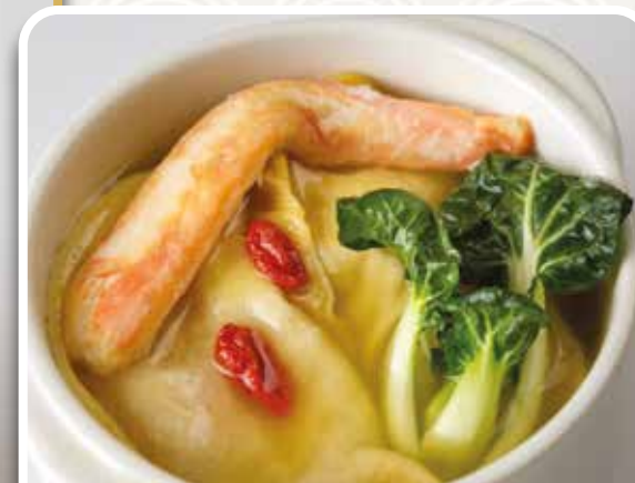
上湯蟹肉灌湯餃 Crab Meat Dumpling Soup £7.80