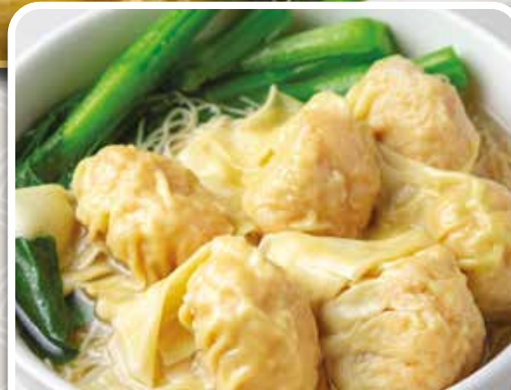
上湯水餃麵 Shrimp Dumplings Soup Noodles £14.80