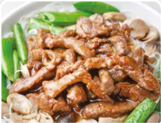
牛柳絲湯米 Shredded Beef Steak Soup Noodles £13.80