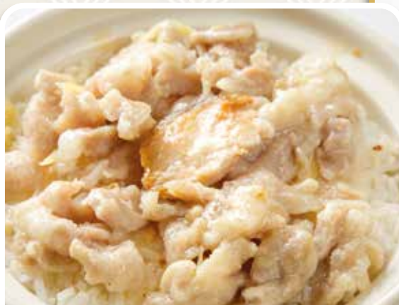
鹹魚肉片飯 Salted Fish & Pork Rice Pot £8.80