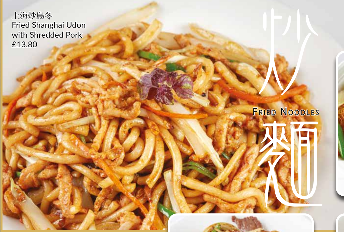
上海炒烏冬 Fried Shanghai Udon with Shredded Pork £13.80