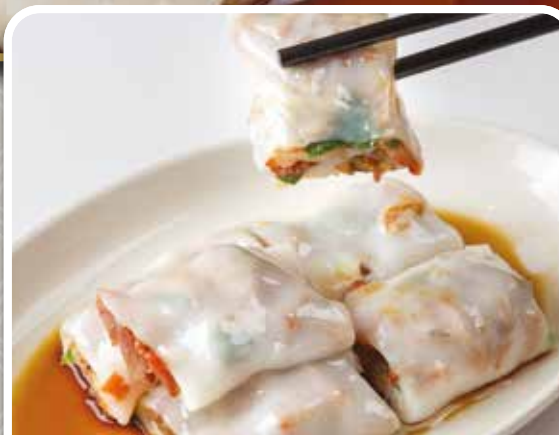
叉燒腸粉 Honey Roast Pork Cheung Fun £7.50