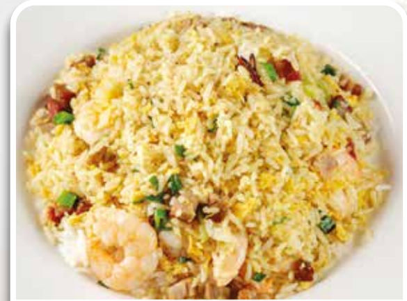
揚州炒飯 Yeung Chow Fried Rice £15.80