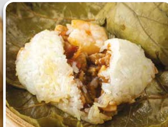
金牌糯米雞 Glutinous Rice in Lotus Leaves £7.50