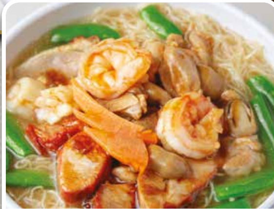
揚州湯麵 Assorted Meats Soup Noodles £14.80