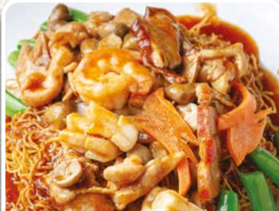
雜燴炒麵 Assorted Meats Fried Noodles £14.80