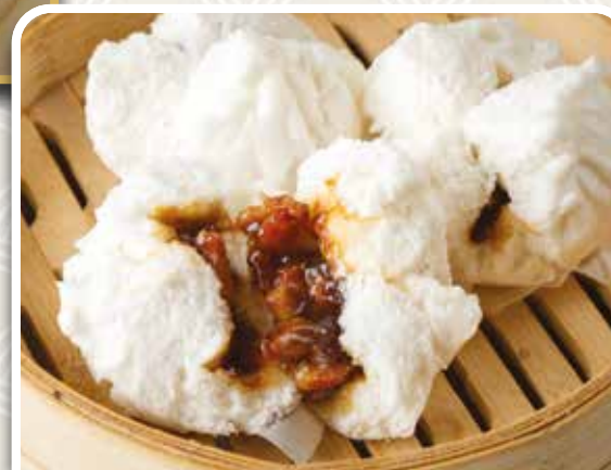
蠔油叉燒包 Roast Pork Buns £6.80