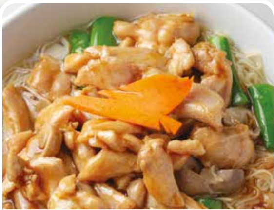
雞球湯麵 Chicken Balls Soup Noodles £13.80