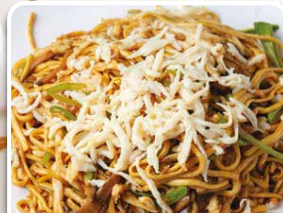
雞絲伊麵 Shredded Chicken E-Fu Noodles £13.80