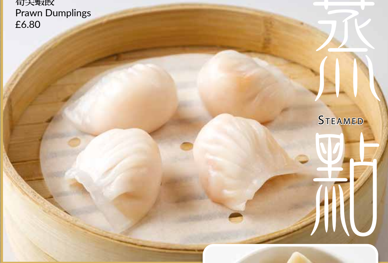
筍尖蝦餃 Prawn Dumplings £6.80