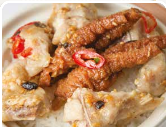
鳳爪排骨飯 Spicy Chicken Feet & Spare Ribs Rice Pot £8.50