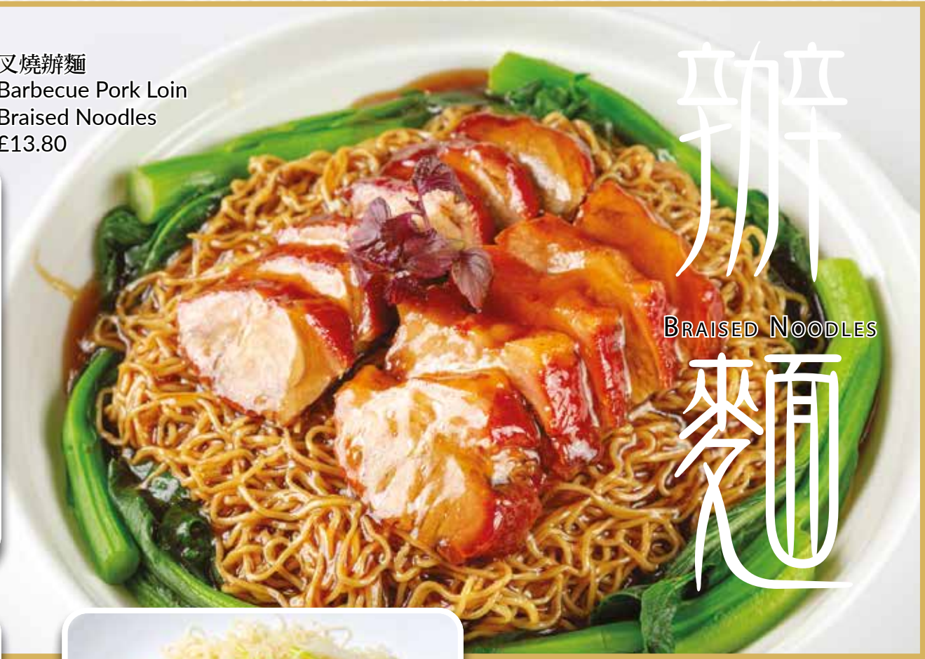
叉燒辦麵 Barbecue Pork Loin Braised Noodles £13.80