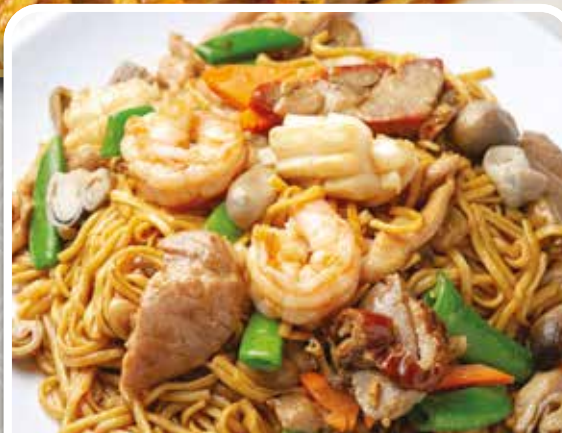
燴府伊麵 Mixed Meat E-Fu Noodles £14.80