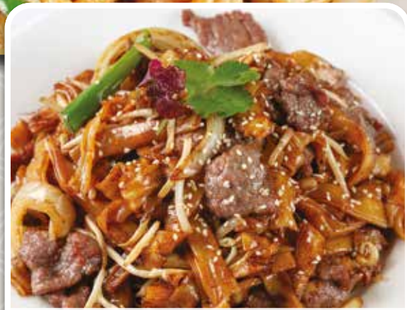
乾炒牛河 Sliced Beef Ho Fun with Soya Sauce £13.80