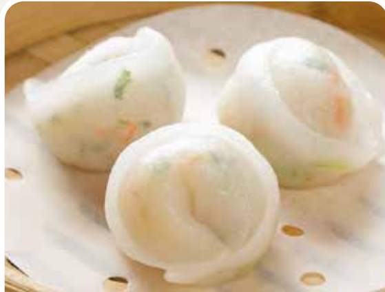
翡翠帶子餃 Scallops Dumplings £6.80