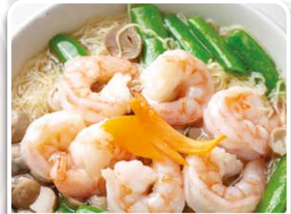
蝦球湯麵 Fresh Prawn Balls Soup Noodles £15.80