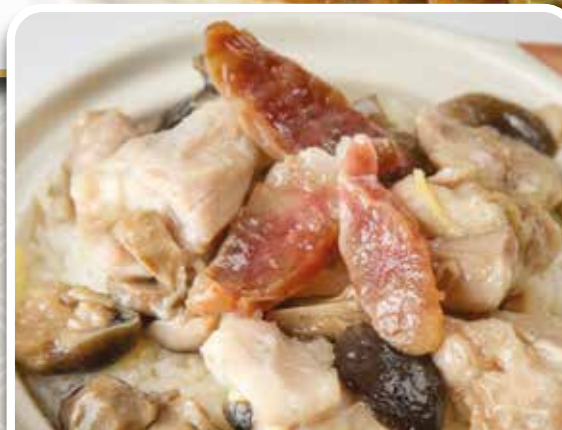
臘腸盅雞飯 Chinese Cured Sausage & Chicken Rice Pot £8.50