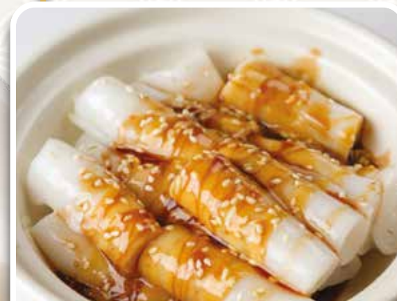
家鄉砵仔腸 Plain Cheung Fun with Peanut Sauce £6.50