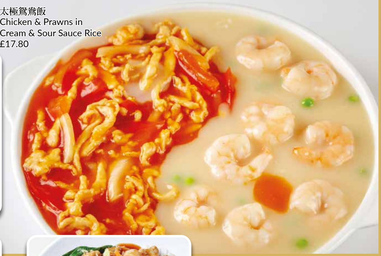
太極鴛鴦飯 Chicken & Prawns in Cream & Sour Sauce Rice £17.80