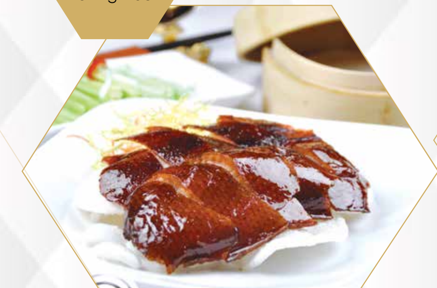
北京填鴨 Peking Duck

1213 海鮮生菜包 Seafood Wrap Served with Lettuce £17.80