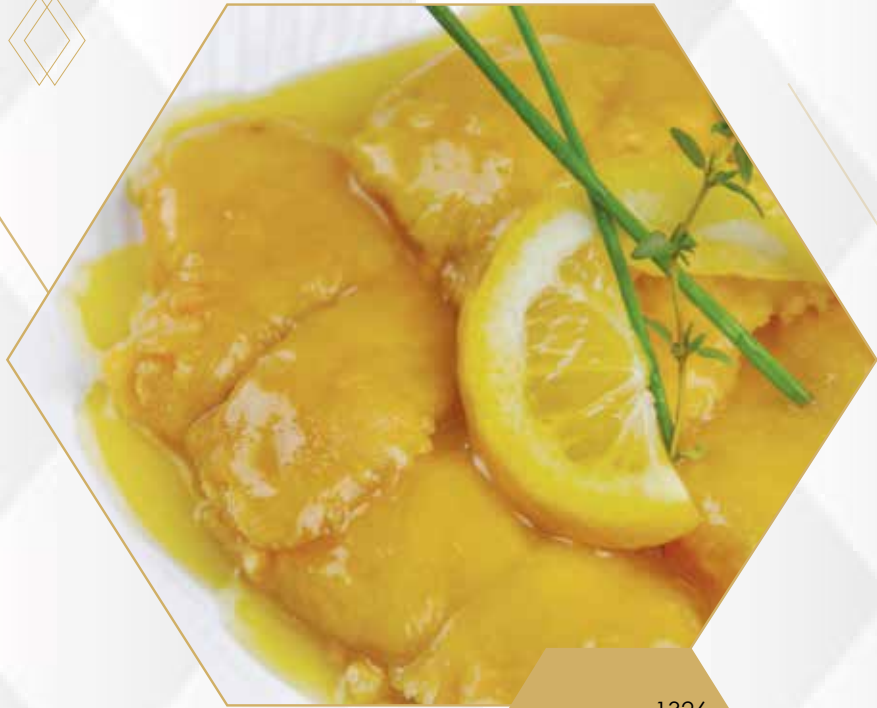
1326 西檸煎軟雞 Lemon Chicken £14.80