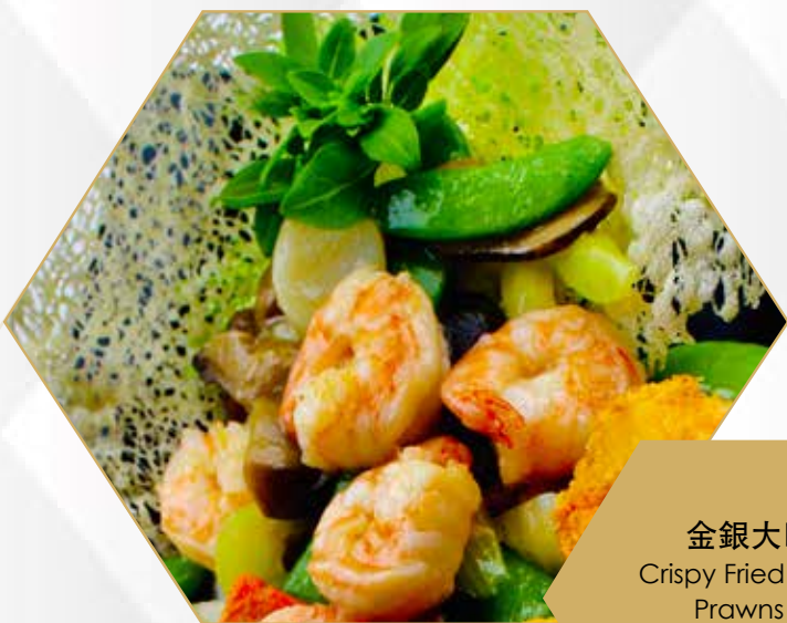
1293 金銀大明蝦 Crispy Fried King Prawns Nest £18.50