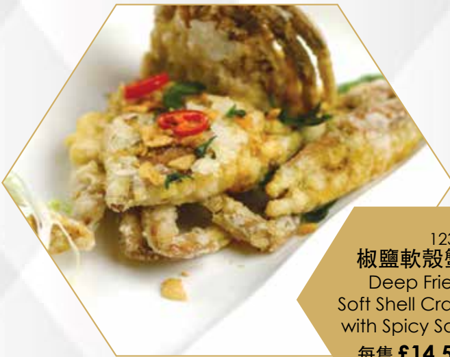
1237 椒鹽軟殼蟹 Deep Fried Soft Shell Crab with Spicy Salt 每隻 £14.50