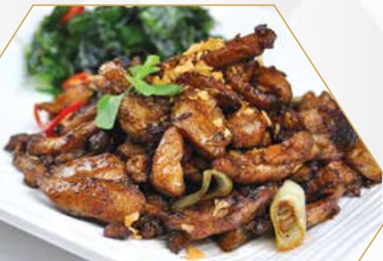
1331 潮式川椒雞 Chicken with Chilli in 'Chiu Chow Style' £14.80

1329 豉椒炒雞球 Sautéed Chicken with Peppers & Black Bean Sauce £14.80