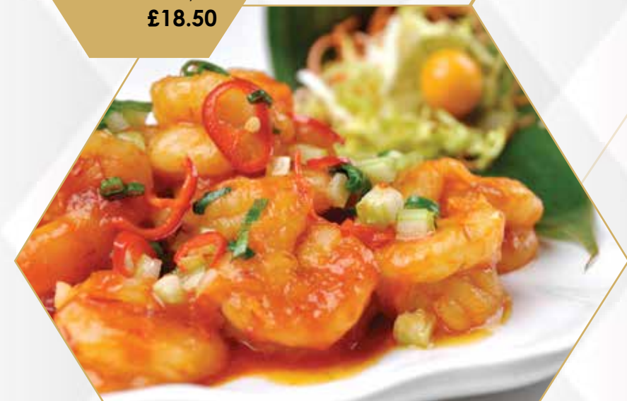
1292 四川蝦 Sautéed Prawns with Red Chilli Sauce 'Szechuan Style' £18.50