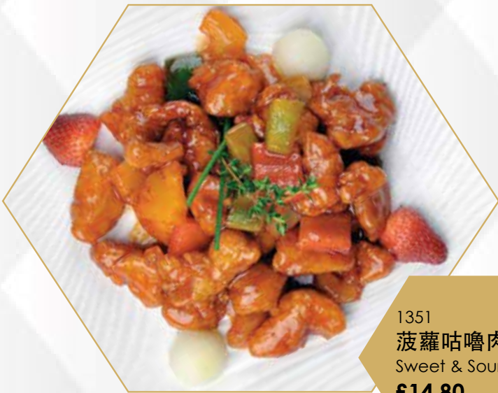
1351 菠蘿咕嚕肉 Sweet & Sour Pork £14.80