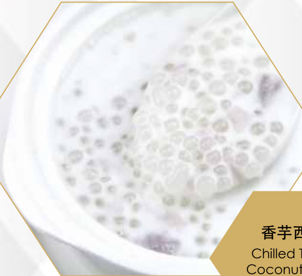
1439 香芋西米露 Chilled Taro & Coconut Sago £6.50