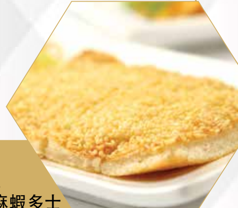
1223 芝麻蝦多士 Sesame Prawn Toast £12.50