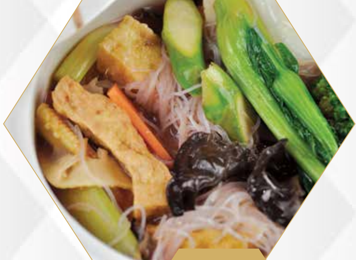
1371 羅漢齋煲 'Shaolin Monks' Vegetables served in Clay Pot £16.80