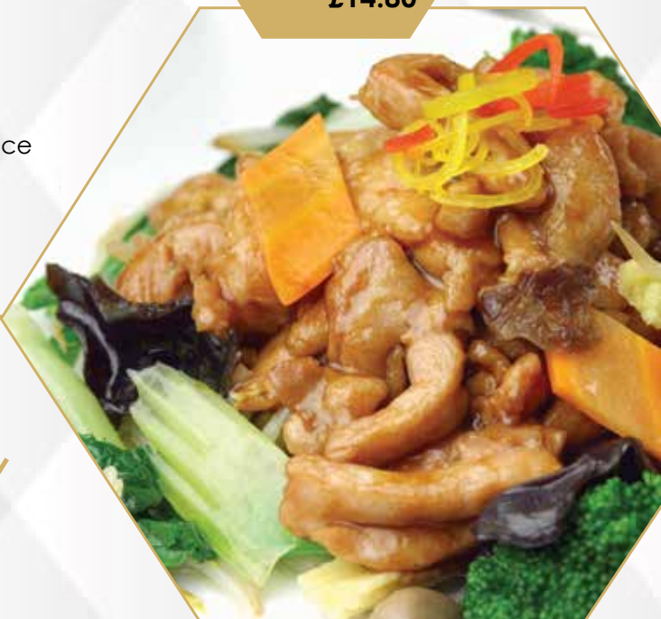
1332 素菜炒雞柳 Sautéed Chicken with Mixed Vegetables £14.80

1330 咖喱雞球 Chicken Fillet in Curry Sauce £14.80