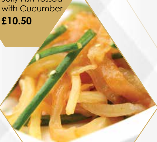
1263 青瓜海蜆 Jelly Fish Tossed with Cucumber £10.50