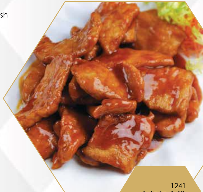
1241 京都焗肉排 Baked Pork Chop with Mandarin Sauce £11.50