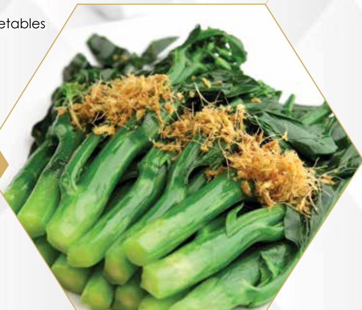
1372 薑汁炒芥蘭 Sautéed Chinese Broccoli with Ginger £17.80