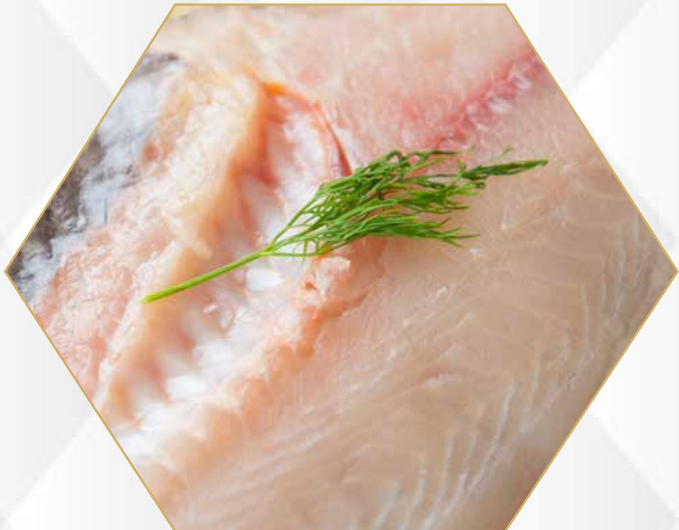
野生多寶魚 Wild Turbot Fish