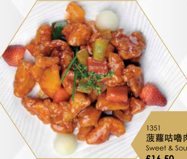
1351 菠蘿咕嚕肉 Sweet & Sour Pork £16.50

1350 黑椒豬柳 Sautéed Pork in Black Pepper Sauce £16.50