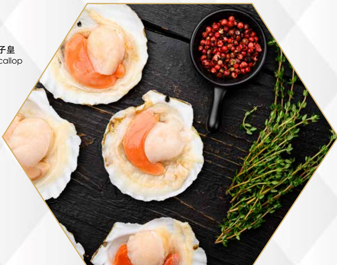
蘇格蘭蛭子皇 Scottish Razor Clam