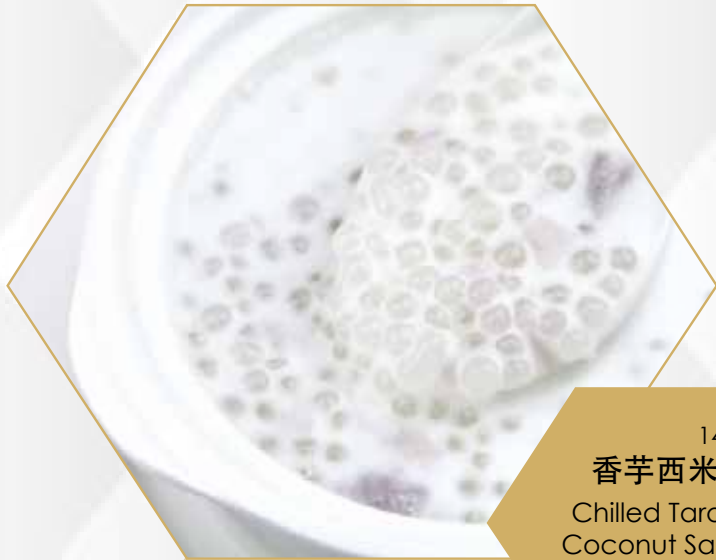
1439 香芋西米露 Chilled Taro & Coconut Sago £7.50