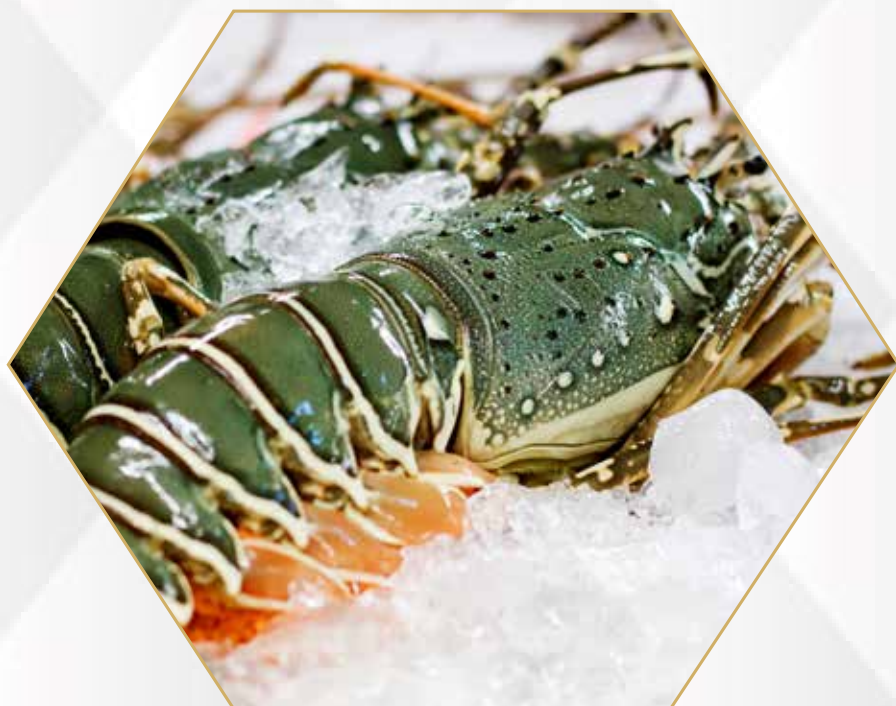
蘇格蘭龍蝦 Scottish Lobster