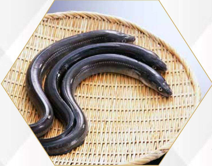
蘇格蘭鱈 Scottish Eel