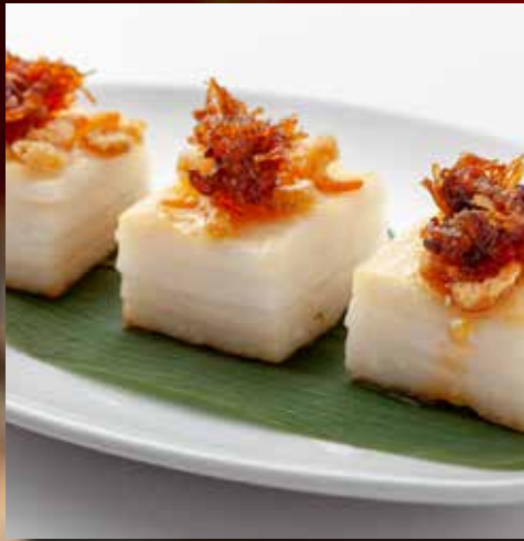
XO醬蝦米糕 Pan Fried Shrimp Rice Cake £5.50