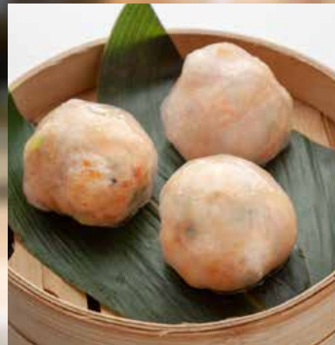
鮮蝦辣蟹餃 Spicy Prawn & Crabmeat Dumpling £5.80