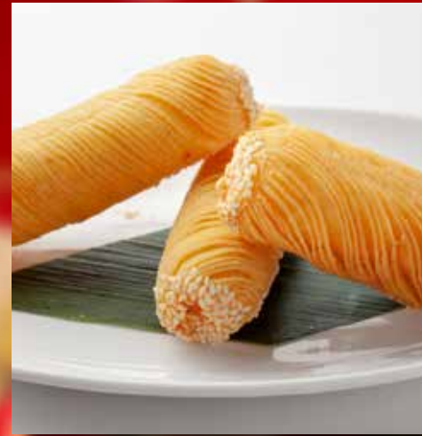
蘿蔔絲酥 Crispy Mooli Pastry £5.20