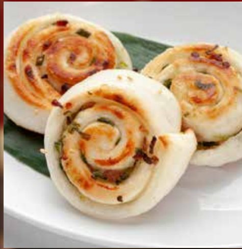
蔥油花卷 Ham & Onion Mini Bun £5.50