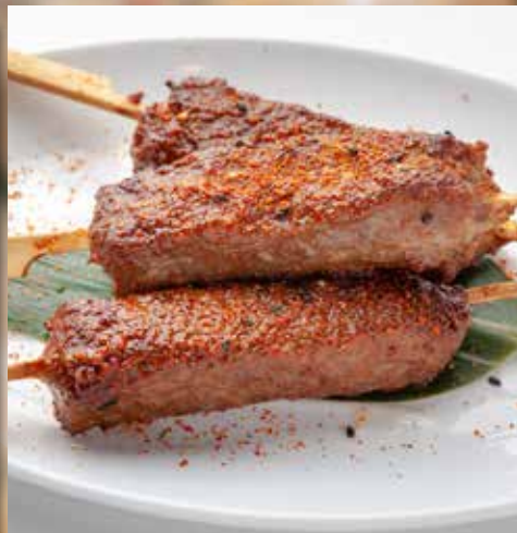
七味羊肉串 Seven Spiced Lamb Skewer £5.50