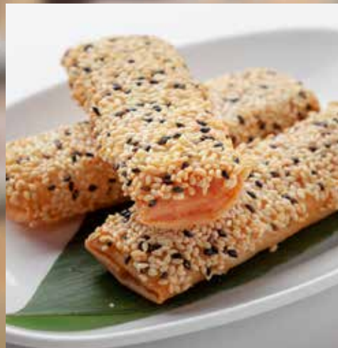
芝士火腿芝麻卷 Deep Fried Cheese & Ham Sesame Roll £5.50