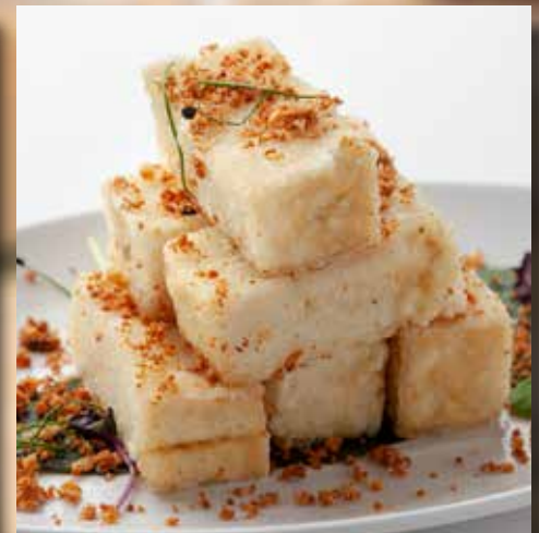
奶油豆腐 Crispy Fried Tofu with Butter Crumble £5.50