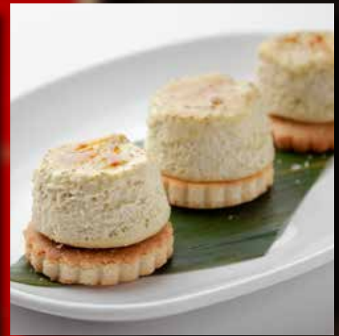
綠茶焦糖布丁 Matcha Crème Brulee £4.80