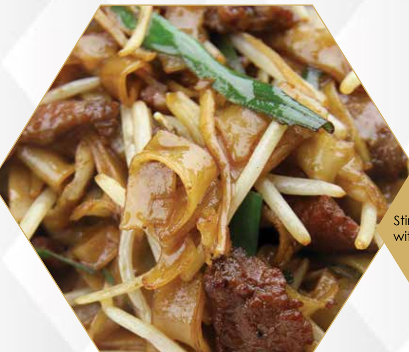
1426 乾炒牛河 Stir-Fried Ho Fun with Sliced Beef £18.50

1425 XO醬海鮮炒麵 Fried Noodles with Seafood with XO Sauce £19.50