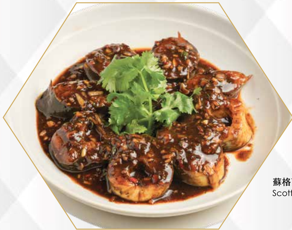
蘇格蘭鱔 Scottish Eel