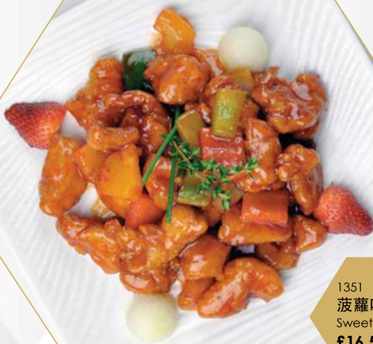
1351 菠蘿咕嚕肉 Sweet & Sour Pork £16.50