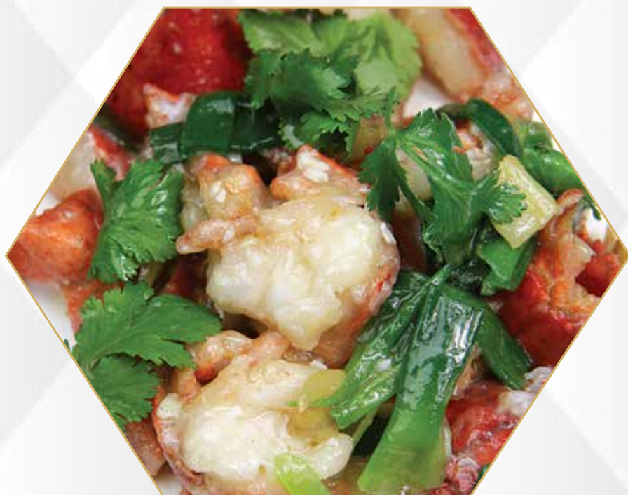
蘇格蘭龍蝦 Scottish Lobster