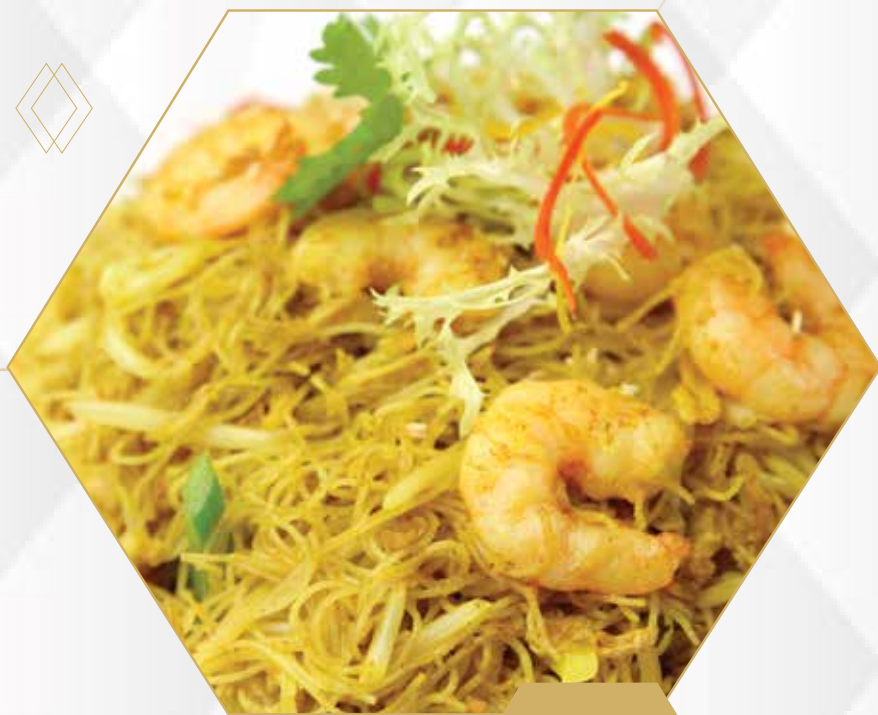
1418 星洲炒米 Singapore Rice Vermicelli £16.50

1420 雜菜炒麵 Mixed Vegetables Noodles (Crispy / Soft) £13.50