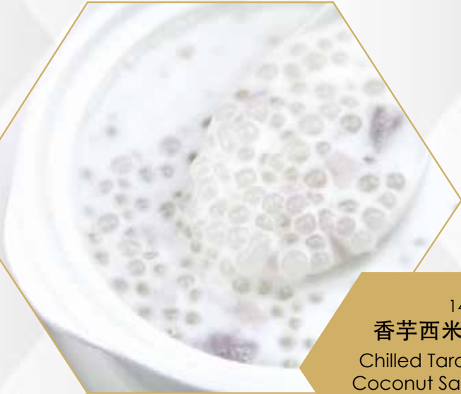
1439 香芋西米露 Chilled Taro & Coconut Sago £7.50