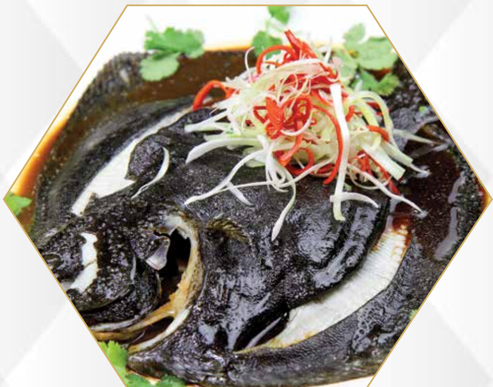
野生多寶魚 Wild Turbot Fish