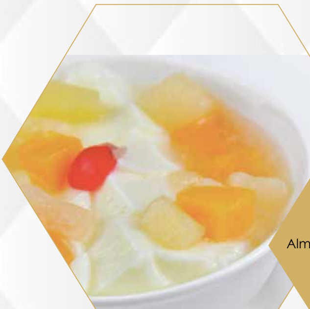
1432 雜果豆腐花 Almond Tofu with Fruit Cocktail £7.50