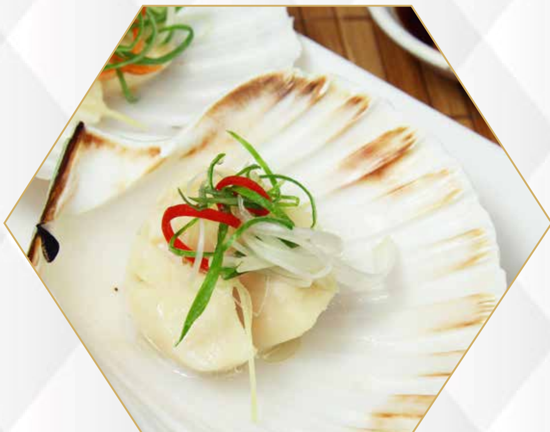
蘇格蘭帶子皇 Scottish Scallop