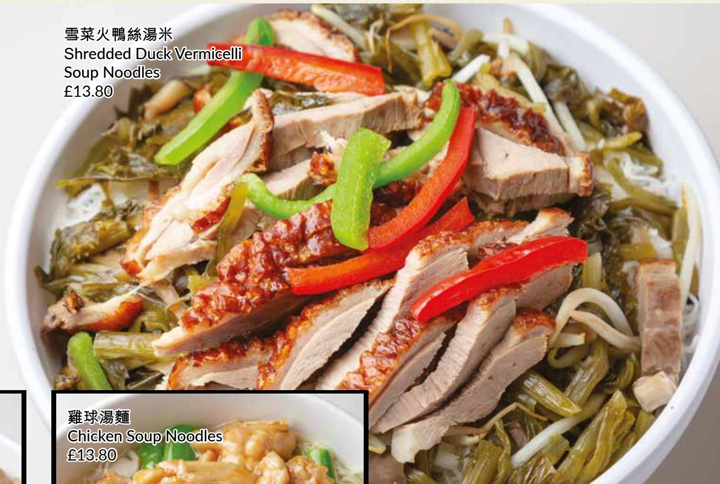
雪菜火鴨絲湯米 Shredded Duck Vermicelli Soup Noodles £13.80