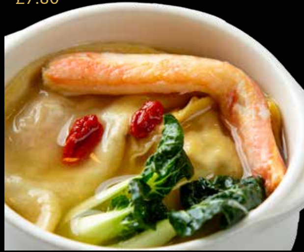
潮州粉果 Pork & Radish Dumplings £6.50