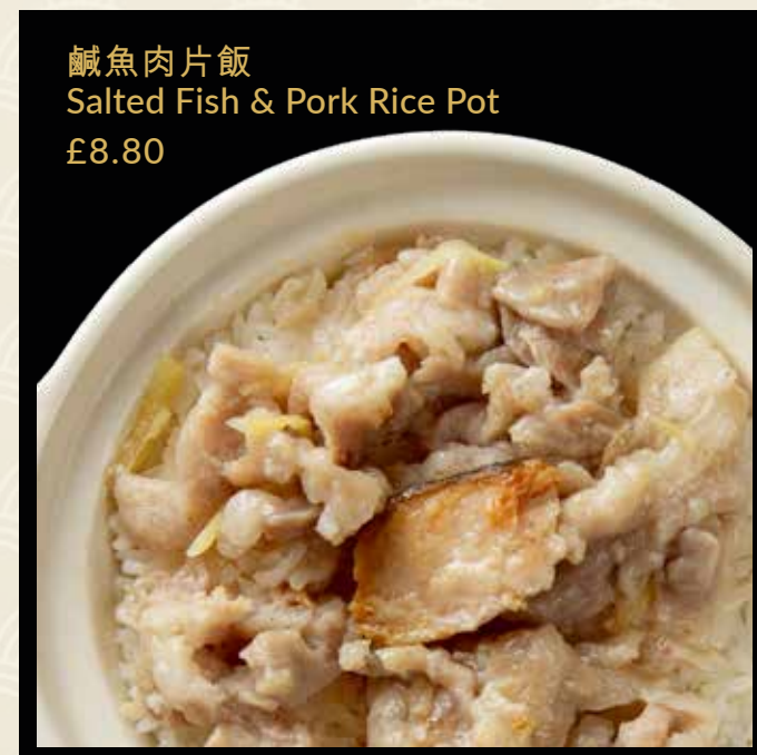
鹹魚肉片飯 Salted Fish & Pork Rice Pot £8.80