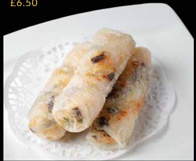
越南春卷 Vietnamese Spring Rolls £6.50