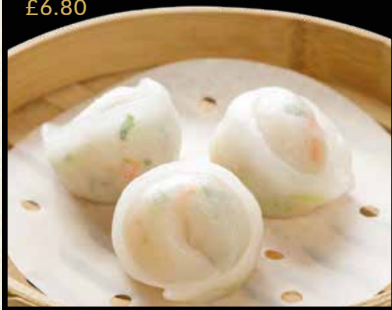
翡翠帶子餃 Scallops Dumplings £6.80