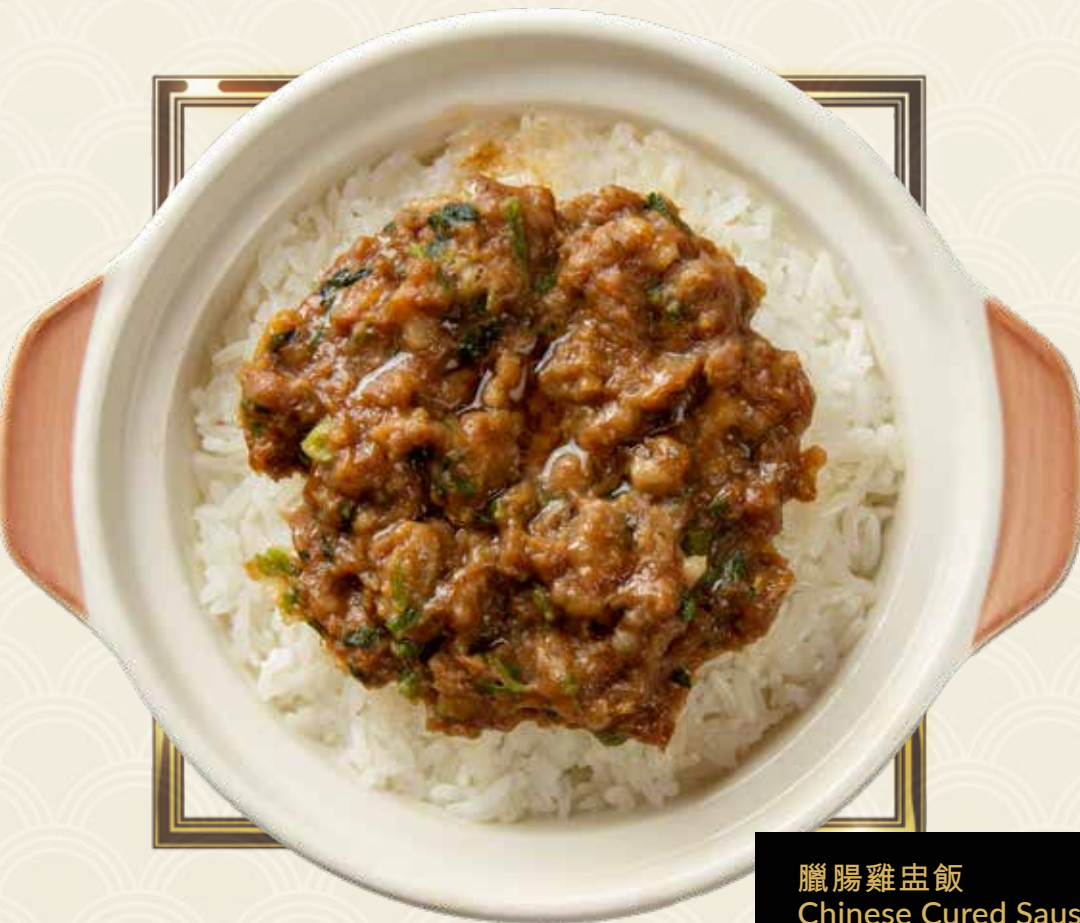
免治牛肉飯 Minced Beef Rice Pot £8.50