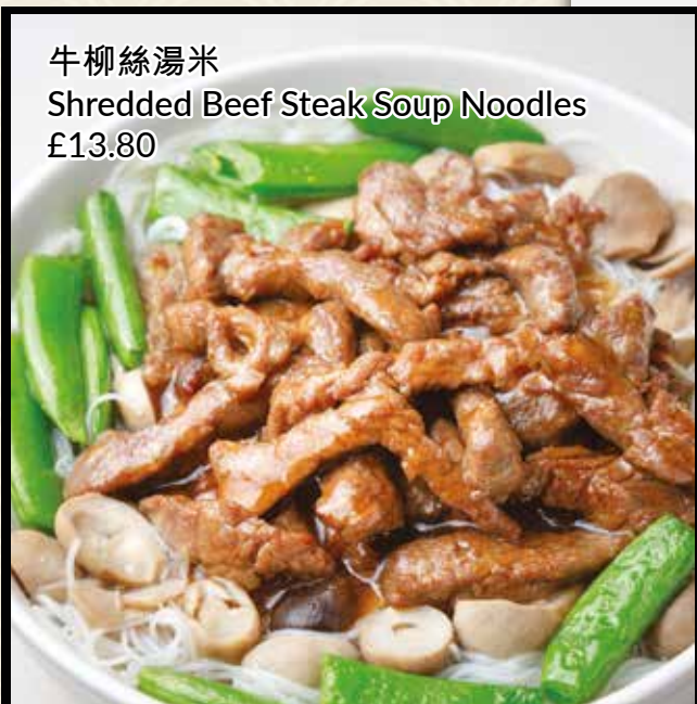
牛柳絲湯米 Shredded Beef Steak Soup Noodles £13.80