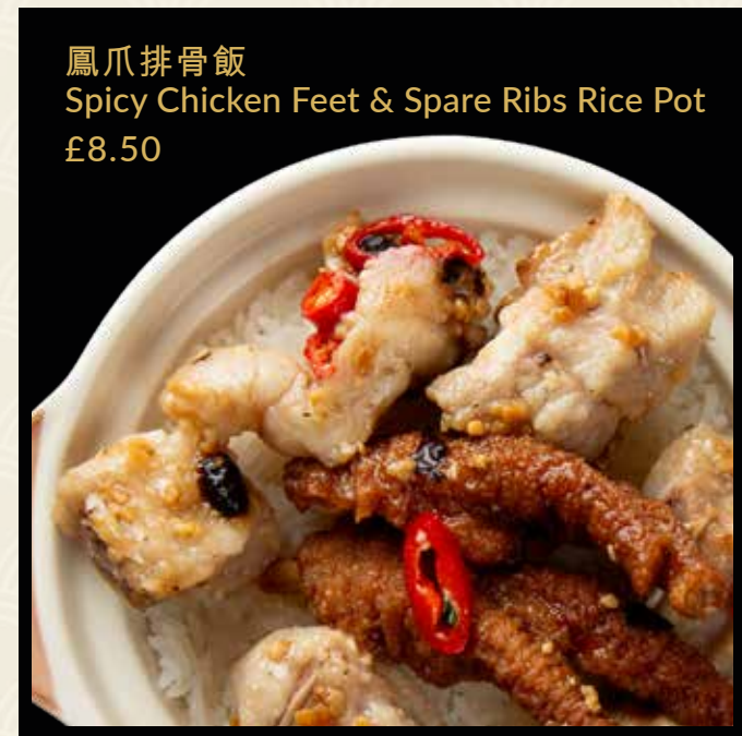
鳳爪排骨飯 Spicy Chicken Feet & Spare Ribs Rice Pot £8.50