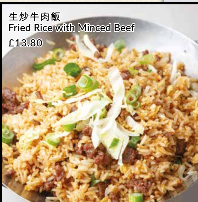
生炒牛肉飯 Fried Rice with Minced Beef £13.80