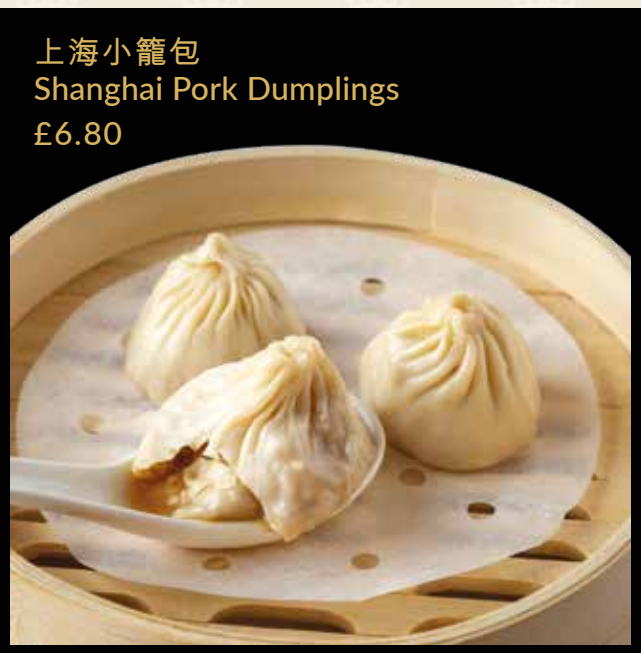
上海小籠包 Shanghai Pork Dumplings £6.80