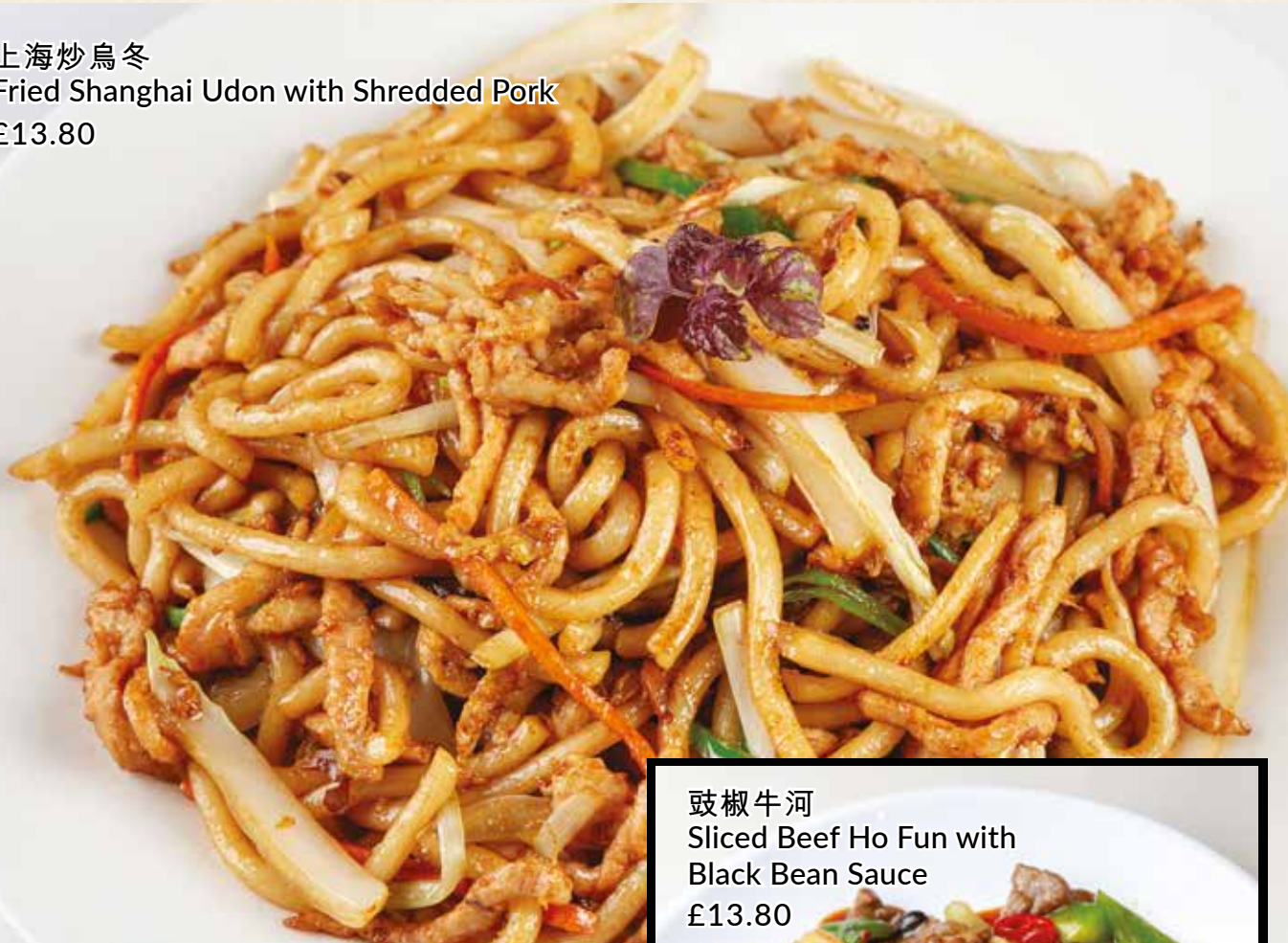
上海炒烏冬 Fried Shanghai Udon with Shredded Pork £13.80