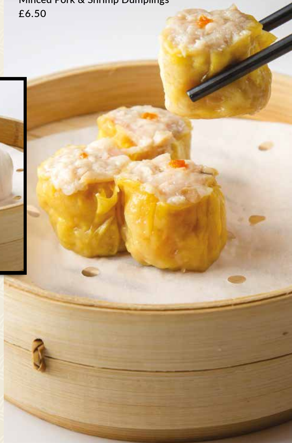
乾蒸燒賣 Minced Pork & Shrimp Dumplings £6.50