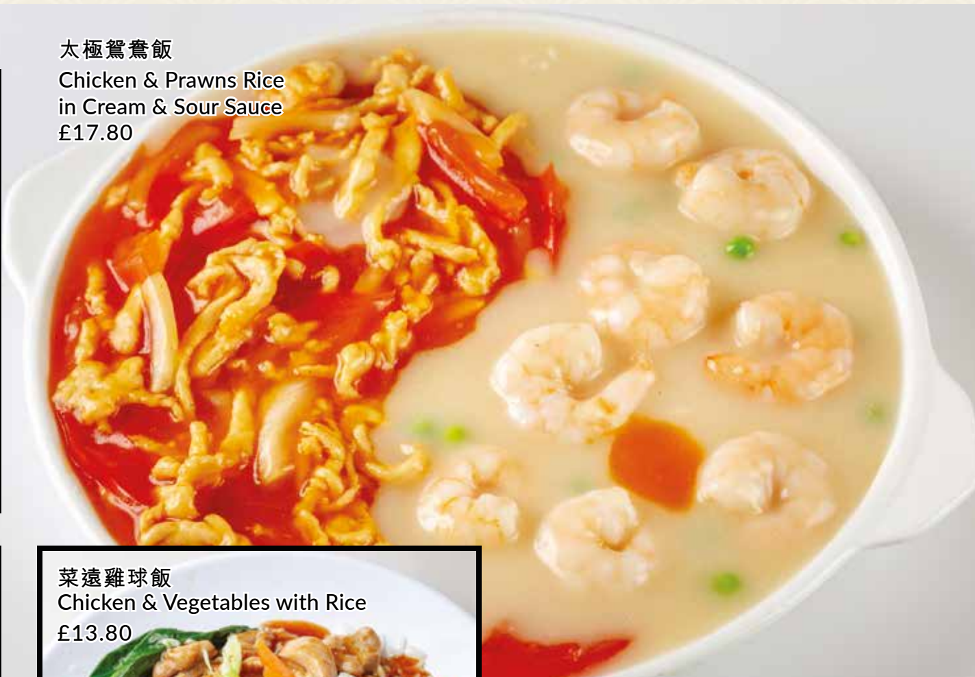
太極鴛鴦飯 Chicken & Prawns Rice in Cream & Sour Sauce £17.80