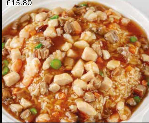
福建炒飯 Fukien Fried Rice £15.80