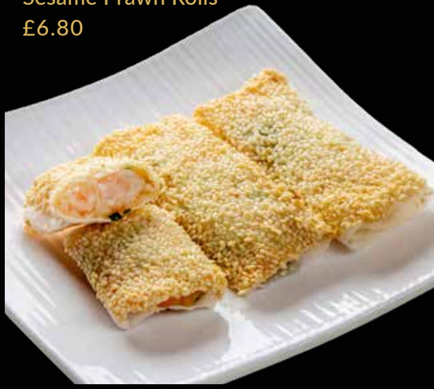
芝麻炸蝦卷 Sesame Prawn Rolls £6.80