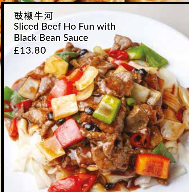
豉椒牛河 Sliced Beef Ho Fun with Black Bean Sauce £13.80