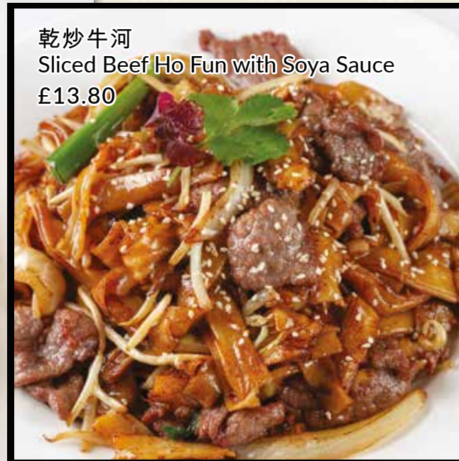
乾炒牛河 Sliced Beef Ho Fun with Soya Sauce £13.80