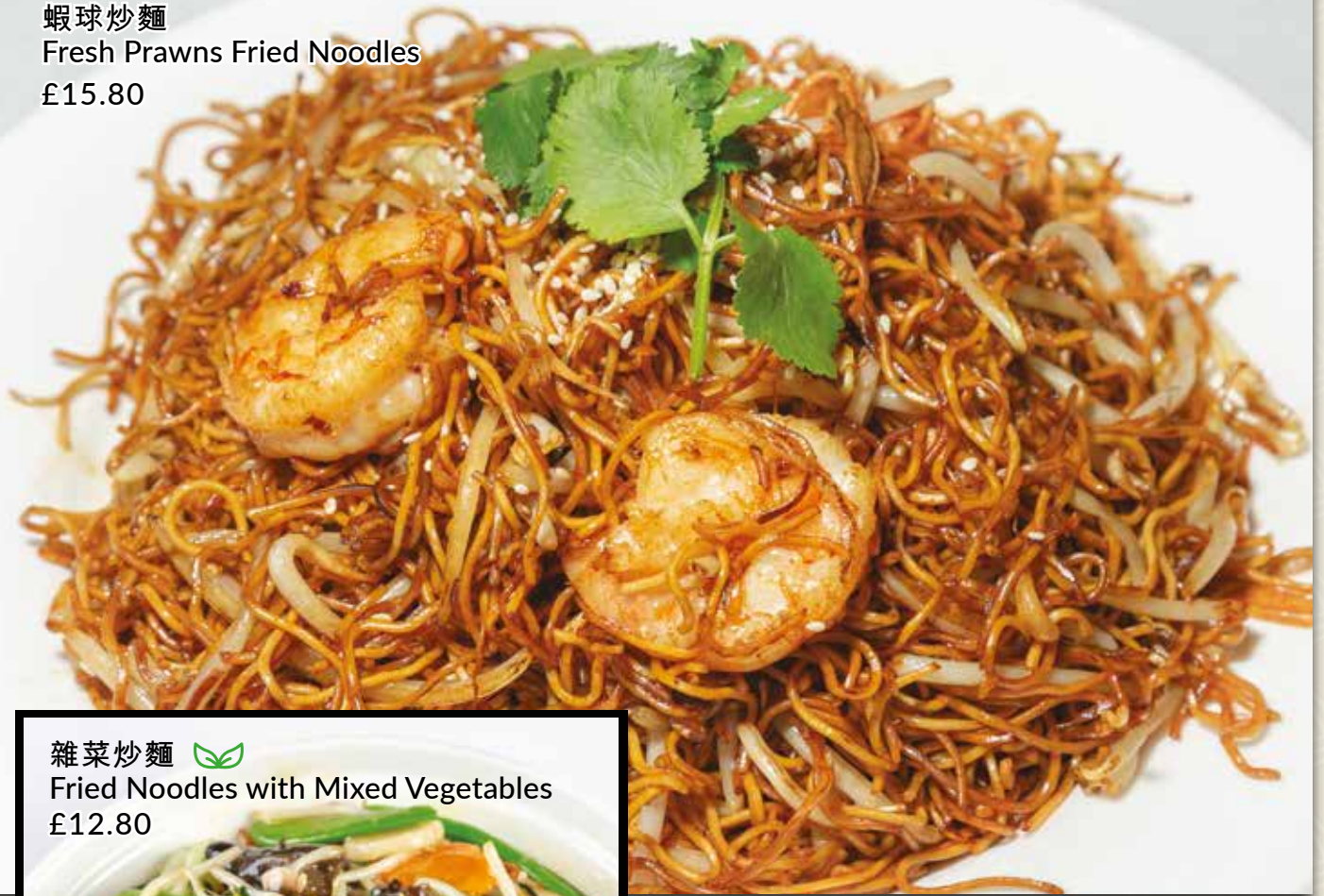
蝦球炒麵 Fresh Prawns Fried Noodles £15.80