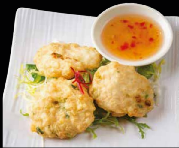
煎炸墨魚餅 Fried Minced Cuttlefish Balls £6.80