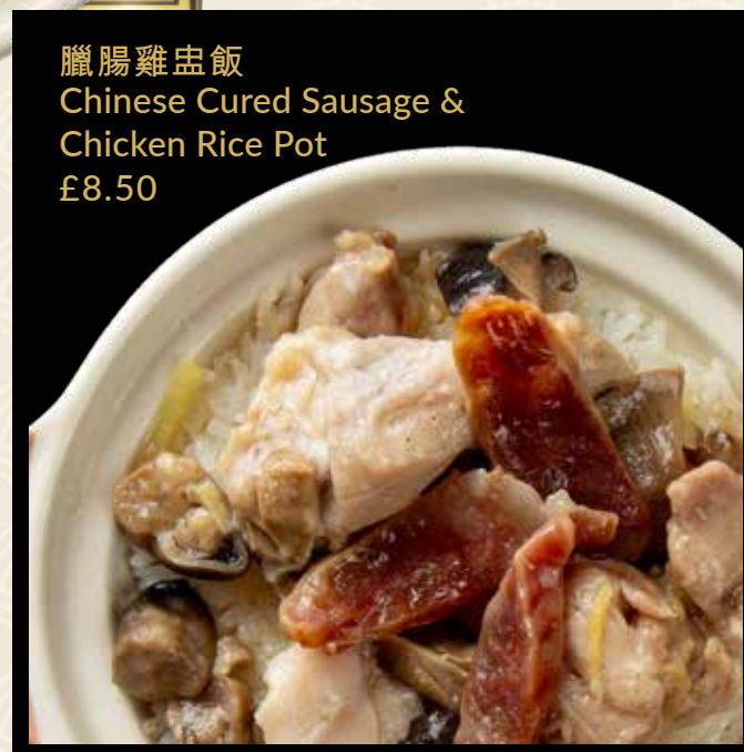
臘腸雞盅飯 Chinese Cured Sausage & Chicken Rice Pot £8.50