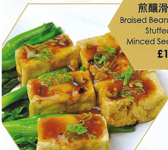
1378 煎釀滑豆腐 Braised Bean Curd Stuffed with Minced Seafood £14.80