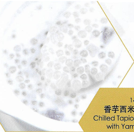
1439 香芋西米露 Chilled Tapioca with Yam in Coconut Soup £4.80