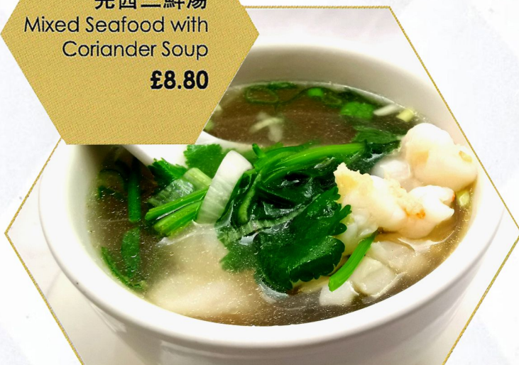
莞茜三鮮湯 Mixed Seafood with Coriander Soup £8.80