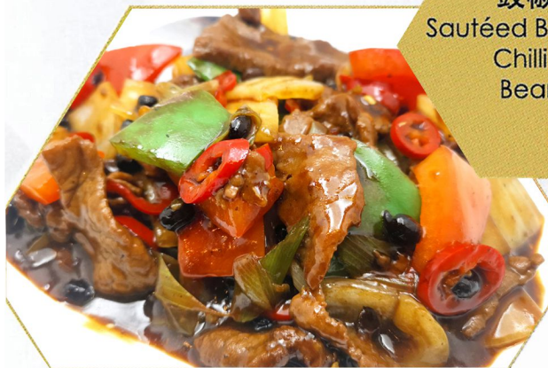
豉椒牛肉片 Sautéed Beef with Chilli & Black Bean Sauce £12.80