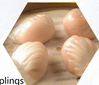
荀尖蝦餃 Prawn Dumplings £6.80