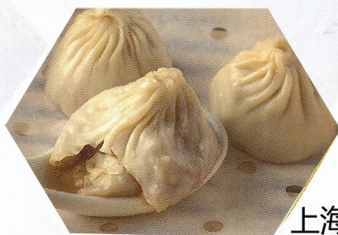
上海小籠包 Shanghai Pork Dumplings £6.20