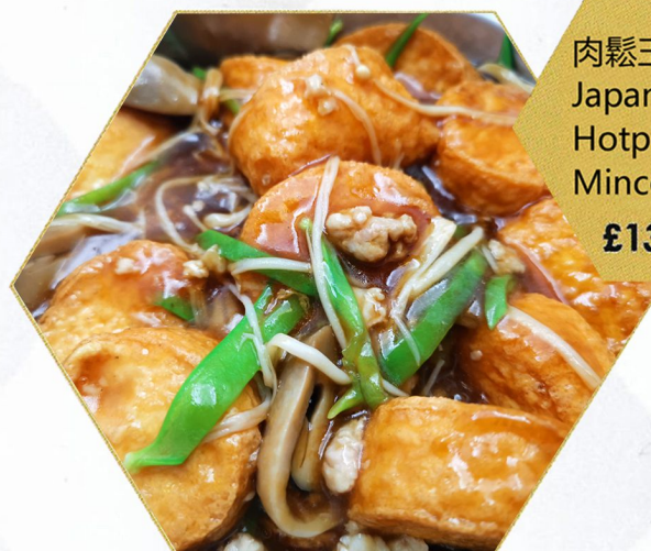
肉鬆玉子豆腐煲 Japanese Tofu Hotpot with Mince Pork