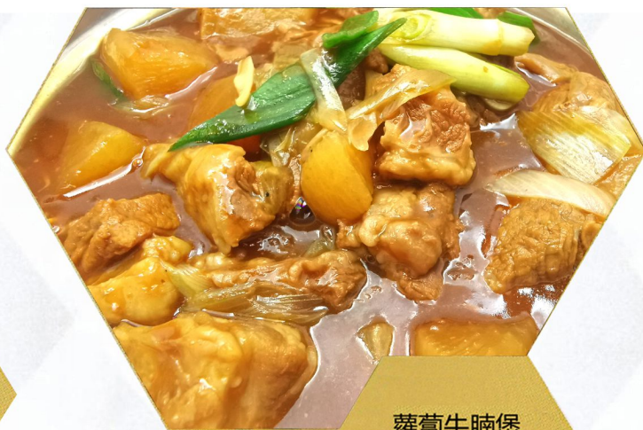
蘿蔔牛腩煲 Beef Brisket Hotpot with Turnip £14.80