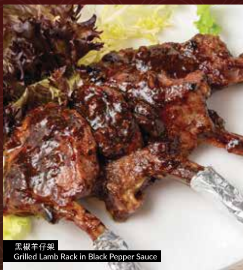
黑椒羊仔架 Grilled Lamb Rack in Black Pepper Sauce

郫縣爆炒肉丁 🌶️ Stir-fried diced Pork in Sichuan Chill Bean Sauce £18.90