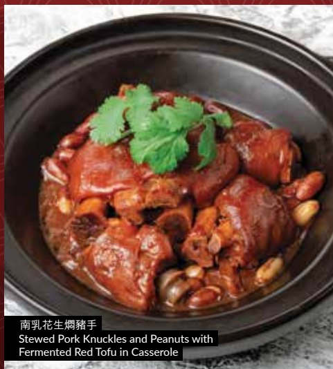
南乳花生燜豬手 Stewed Pork Knuckles and Peanuts with Fermented Red Tofu in Casserole

南乳花生燜豬手 🏆 Stewed Pork Knuckles and Peanuts with Fermented Red Tofu in Casserole £18.50